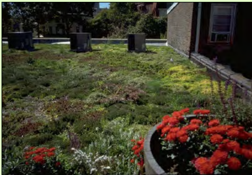
Figure 1. Fencing Academy of Philadelphia vegetated roof cover.