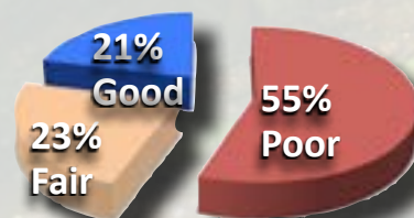
Overall Biological Condition