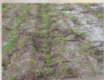
Winter cover crops help prevent soil loss.