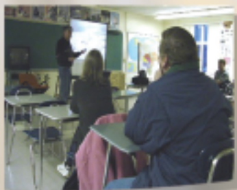
Farmers learn about the project at an educational forum.