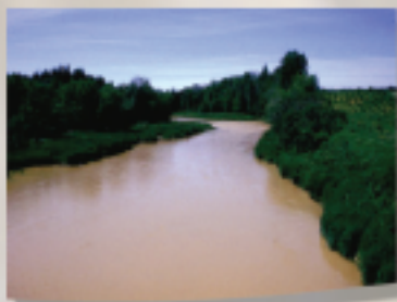
Soil erosion harms the fish and turns the Meduxnekeag River an unsightly brown.