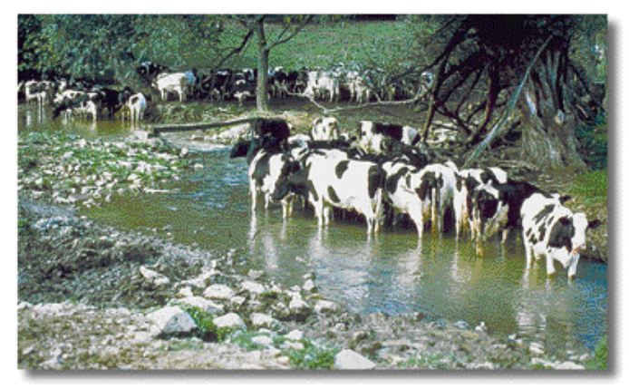
Fencing off natural streams from cattle will reduce sedimentation and nutrient pollution.

In some cases farmers use animal waste as fertilizer, and even though it's natural, if used incorrectly it can do terrible damage to water resources. In fact, it can cause eutrophication, or algae buildup, which depletes the oxygen aquatic organisms need to breathe.