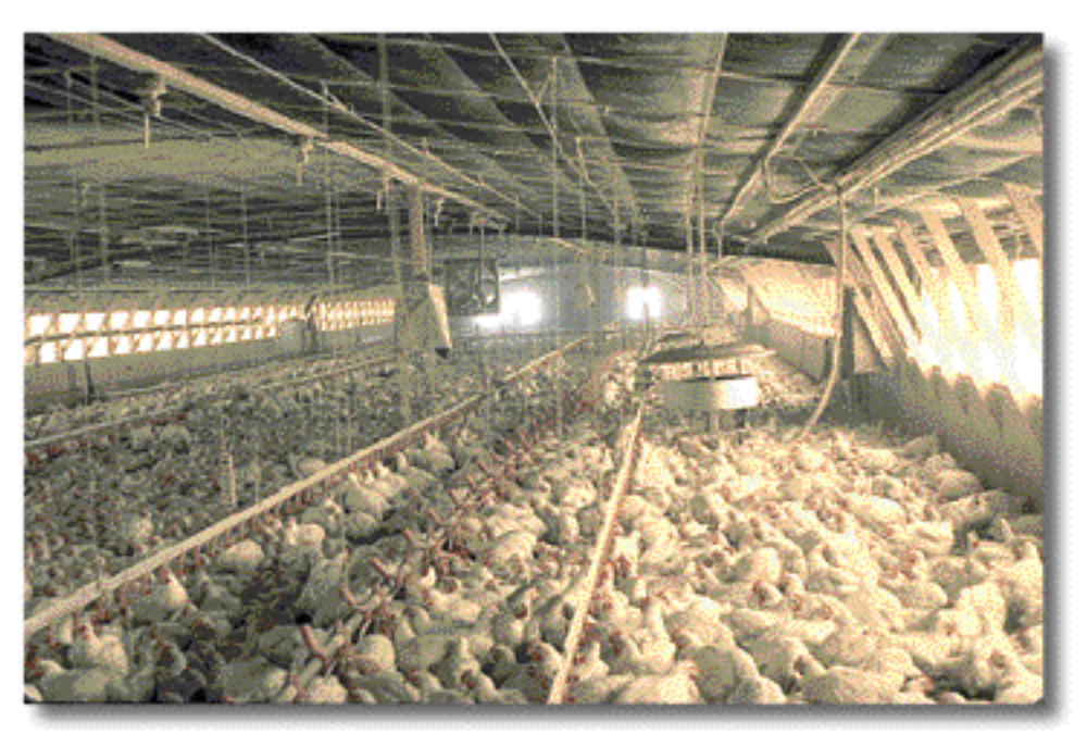
Poultry farms produced 116 billion pounds of manure in a single year.

It's not just animals, though. Chemicals in pesticides, herbicides, fungicides, and fertilizers are a third cause of water pollution. Pesticides, herbicides, and fungicides are used to kill pests such as crop-eating insects and to control the growth of weeds and fungi. Fertilizers are used to feed crops and make them grow faster and healthier. Unfortunately, chemicals used to kill bugs and weeds can also damage other things. These chemicals can enter and contaminate water in several ways-through use and overuse in or around the water, from runoff, or by the wind. And their effects can be deadly. The chemicals can kill fish and other wildlife, poison food sources, and destroy the habitat that small animals use to hide from predators.