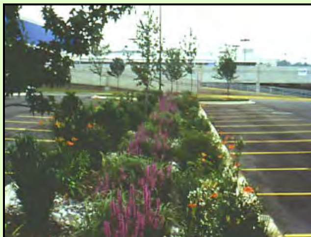
Figure 1. Bioretention landscaping at the Inglewood demonstration project site.

A landscaped island measuring approximately 38 feet by 12 feet was chosen as the retrofit area. The island contains a curb inlet that drains into the municipal storm drain system. Almost the entire drainage area is impervious. A 4-foot slot was cut into the curb immediately before the inlet. The landscaped island was then excavated to a depth of 4 feet. An underdrain was installed and tied into the bottom of the existing inlet to completely drain the planting soil to avoid oversaturation. The underdrain was covered with 8 inches of 1- to 2-inch gravel and backfilled with typical bioretention soil mix. The backfill extended to a depth of about 12 inches below the top of the curb, which allows for a ponding depth of approximately 6 inches of water in the island