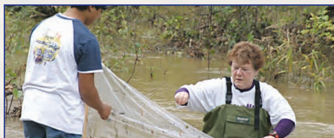
Students learn water quality monitoring techniques.