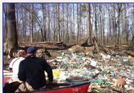
A project goal is to reduce floatable trash by 20 percent.

"The Fourche Creek float was an experience I never thought I would have in the heart of Little Rock. The ancient trees, the shade, the winding stream channels, and the flash of birds: green heron, great horned owl, and Mississippi kites. I would never have known about it had I not been involved with Audubon."