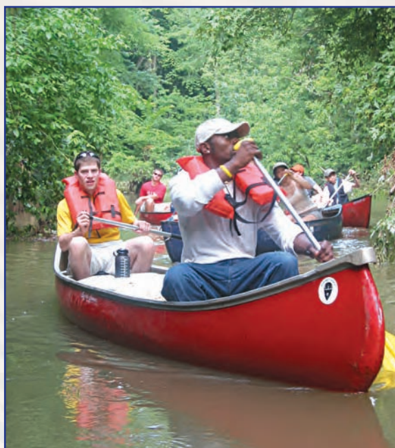
Interns learn about wetland and forest habitats.