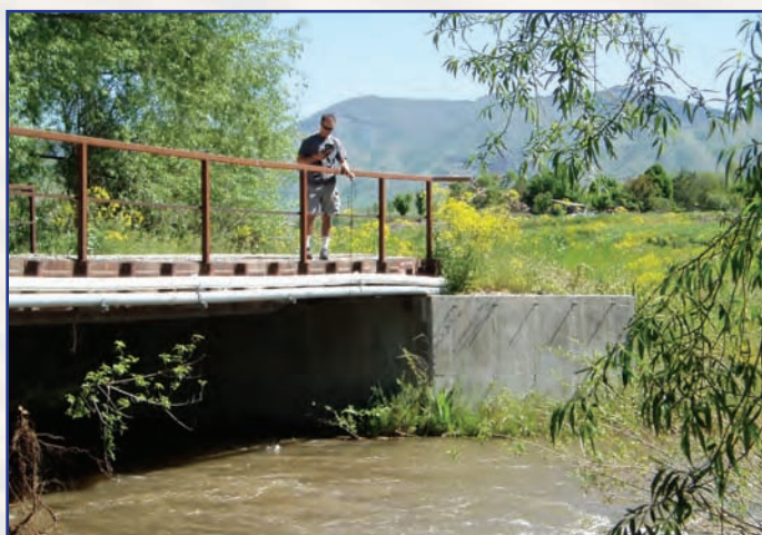
Project personnel scope out potential sites for real time streamflow and water quality monitoring.