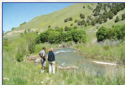
Project participants examine a restoration site.