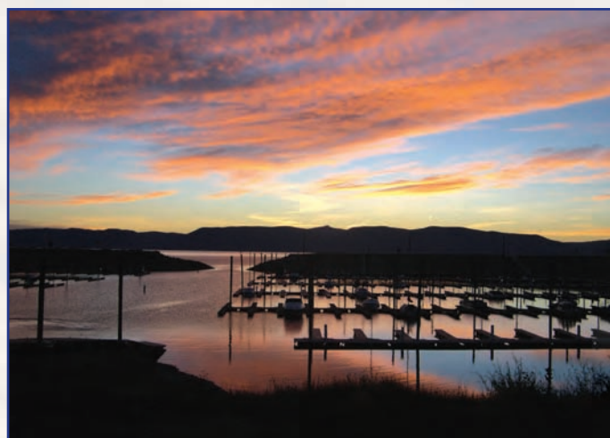
A late summer sunrise over the Bear Lake Marina. Bear Lake is the recreational gem of the watershed and provides opportunities from boating and camping to ice fishing.