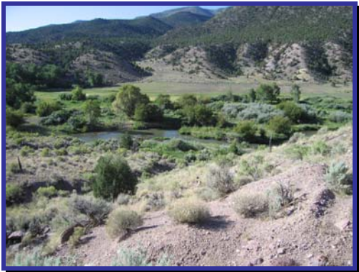
East Fork of the Upper Sevier River.