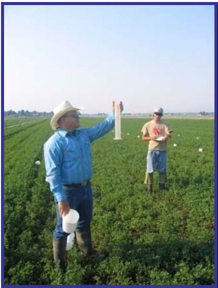
Reading catch cups.