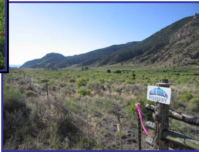
Along the East Fork of the Upper Sevier River.