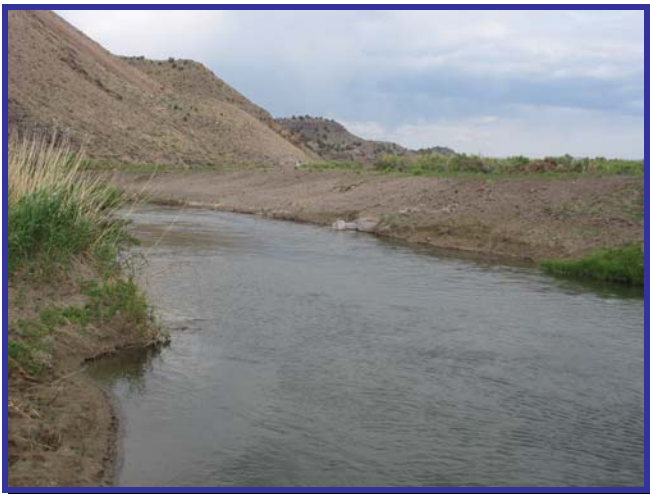
Riparian restoration site along the Upper Sevier River.