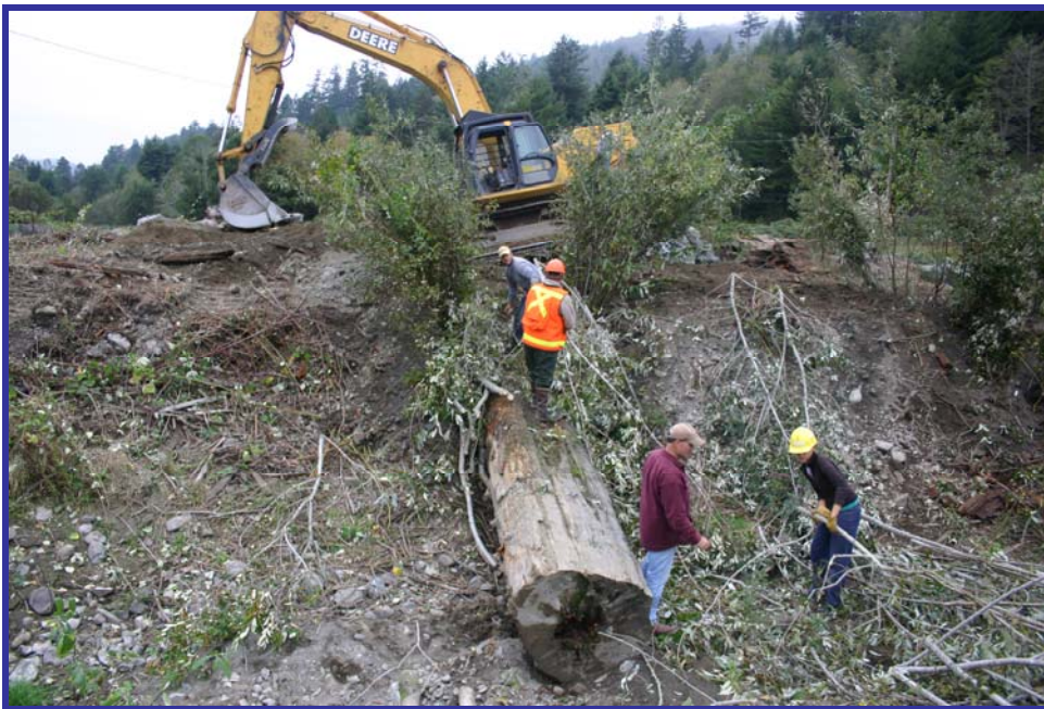
Using logs from decommissioned roads for floodplain bank recovery.