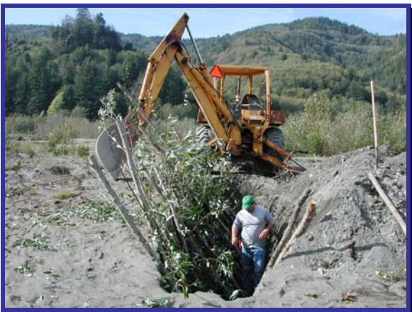
Installing willow baffles to recapture floodplain and promote riparian recovery.