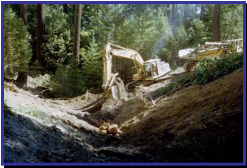
Stream restoration on the South Fork of the Trinity River.