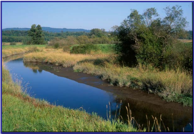
Fisher Slough contains 50 acres of tidal wetlands that will be restored.