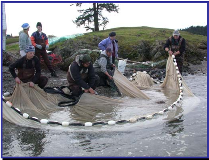
Skagit River System Coop salmon sampling crew.