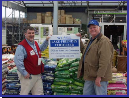
Stores around the Lake Hopatcong Watershed display signs to promote the sale of lake-friendly fertilizer.

Since its creation in 2001, the Lake Hopatcong Commission has partnered with the New Jersey Department of Environmental Protection, the four lakeshore towns and two counties in the watershed and the Commission's environmental consultant, to improve the lake's water quality.