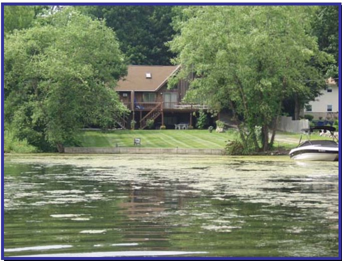
Innovative retrofits using iron-oxide sleeves to reduce the phosphorus load will be installed in catch basins alongside Ingram Cove in Hopatcong Borough to protect the fishery and recreational use of the lake.