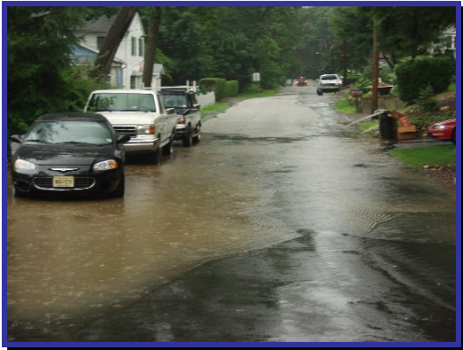
Installation of Best Management Practices devices will address stormwater runoff, as shown in Jefferson Township.