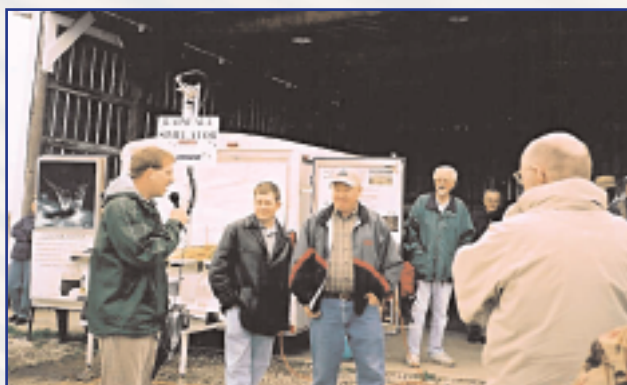
Macon County SWCD watershed tours educate urban and rural residents about conservation practices.