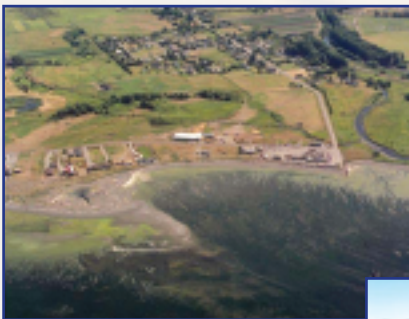
Aerial photos of the Dungeness watershed.

The Dungeness River of Washington State, located on the Olympic Peninsula of northern Puget Sound, originates in the steep Olympic Mountains and flows 32 miles through wilderness, forest, and valley before reaching its bay. The 200-square-mile watershed is home to more than 200 fish and wildlife species and an important stop for migratory waterfowl. The river supports seven salmonid species, and the bay is noted for bountiful crab and other shellfish. Over the years, the area has been steadily converted from forest to agricultural and residential land uses. An extensive irrigation system, diverting water for lawns, crops, and hobby farms, adds to the pastoral setting of the valley. The Jamestown S’Klallam Tribe, which has historically depended on the watershed’s cultural and natural resources, retains treaty rights to fish, hunt, and gather shellfish here.