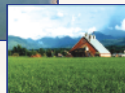
A view of the valley.

"The cooperative efforts of the tribe and our project partners have been key to understanding the water quality problems in the Dungeness watershed. Integrating our water quality improvement projects will help to restore our watershed's health."