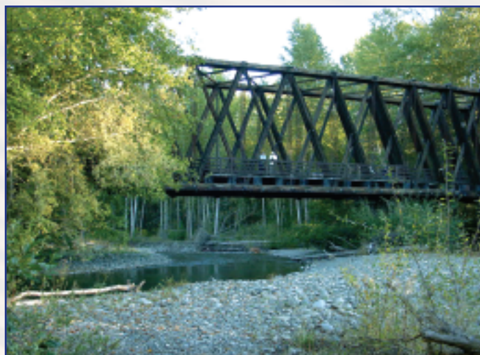
Scenic image of the river from the south.