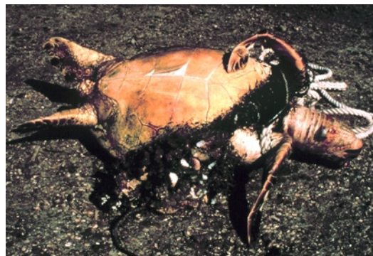
Several marine mammal, sea turtle, and bird species are in danger of extinction in large part from entanglements in fishing gear and other debris. This turtle was killed by boat debris.

If you've ever accidentally splashed a little gasoline on your hands when filling a car tank, you know that gas smell is pretty powerful and sticks around a long time. In fact, as little as one quart of oil or gasoline can contaminate up to 250,000 gallons of water. So here we have a dilemma—motors on powerboats need oil and