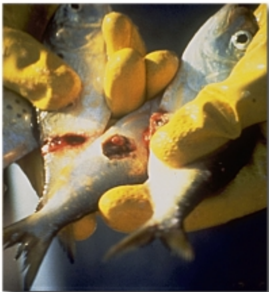
Some fish finished by pfiesteria.

presence of fish, pfiesteria transforms from an inactive cyst to a cyst that produces a poison. Pfiesteria uses this poison to stun fish, making it easier to