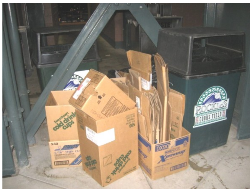
Caption: vendors place cardboard and reusables on concourse area

Concession vendors are also targeted for recycling. Premium beverages, originating in glass bottles, are poured into a cup for fan consumption. These glass bottles are captured directly from the concession area in source-separated roll carts. Before and after the game, vendors place cardboard out on the concourse for collection by crews in gondola carts. In addition, vendors bag trash and place it in piles on the concourse. Vendors also place reusables, such as beverage kegs, for collection and return.