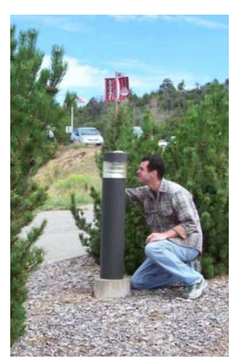
BLM replaced exterior lighting with energyefficient models.