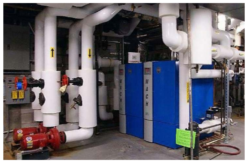
Engineered sites received boiler assessments and upgrades as part of the BLM ESPC.

BLM awarded a third ESPC delivery order in March 2010 covering the second half of BLM states as well as additional work for states covered by the first two project phases. These additional tasks include remote monitoring and renewable energy installations. Plans call for JCI to install up to 1 megawatt of solar photovoltaics and wind across 23 sites.