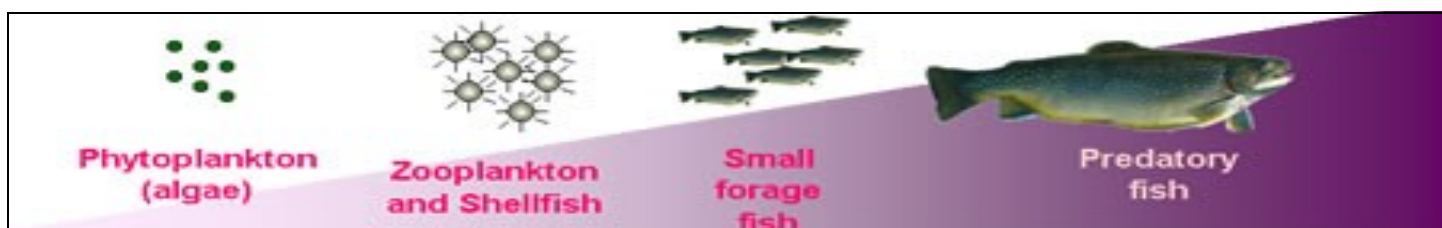
Figure 2: Mercury becomes more concentrated up the food chain (U.S. EPA)