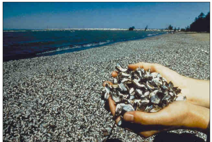
Lake Erie beach covered by zebra mussel shells.

New non-native invasive species must be prevented from colonizing the Lake Erie ecosystem. The spread of already established non-native invasive species must be controlled and reduced where feasible.