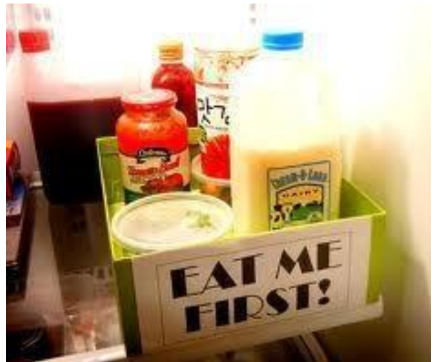
Graphic from West Coast Materials Management Forum