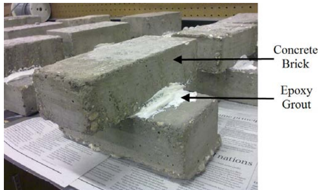
Figure 1. Formation of sandwich specimens.

Interaction between the grout and a concrete substrate was evaluated by testing the bonding strength and type of failure (i.e., bonding failure, substrate failure, or a combination) of prepared concrete bricks to which grout was applied under different service conditions. The test sandwich specimens were formed by applying grout material to an area of one concrete brick, then overlapping a second brick in a perpendicular direction to the first to allow the grout to form a filling between the overlap areas, as shown in Figure 1.