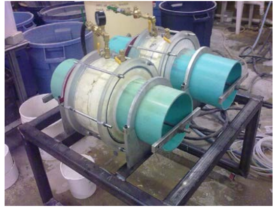
Figure 3. Model test setup.