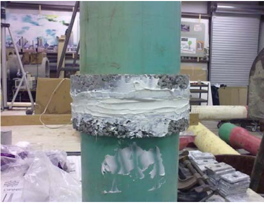
Figure 2. Repaired cracked concrete.