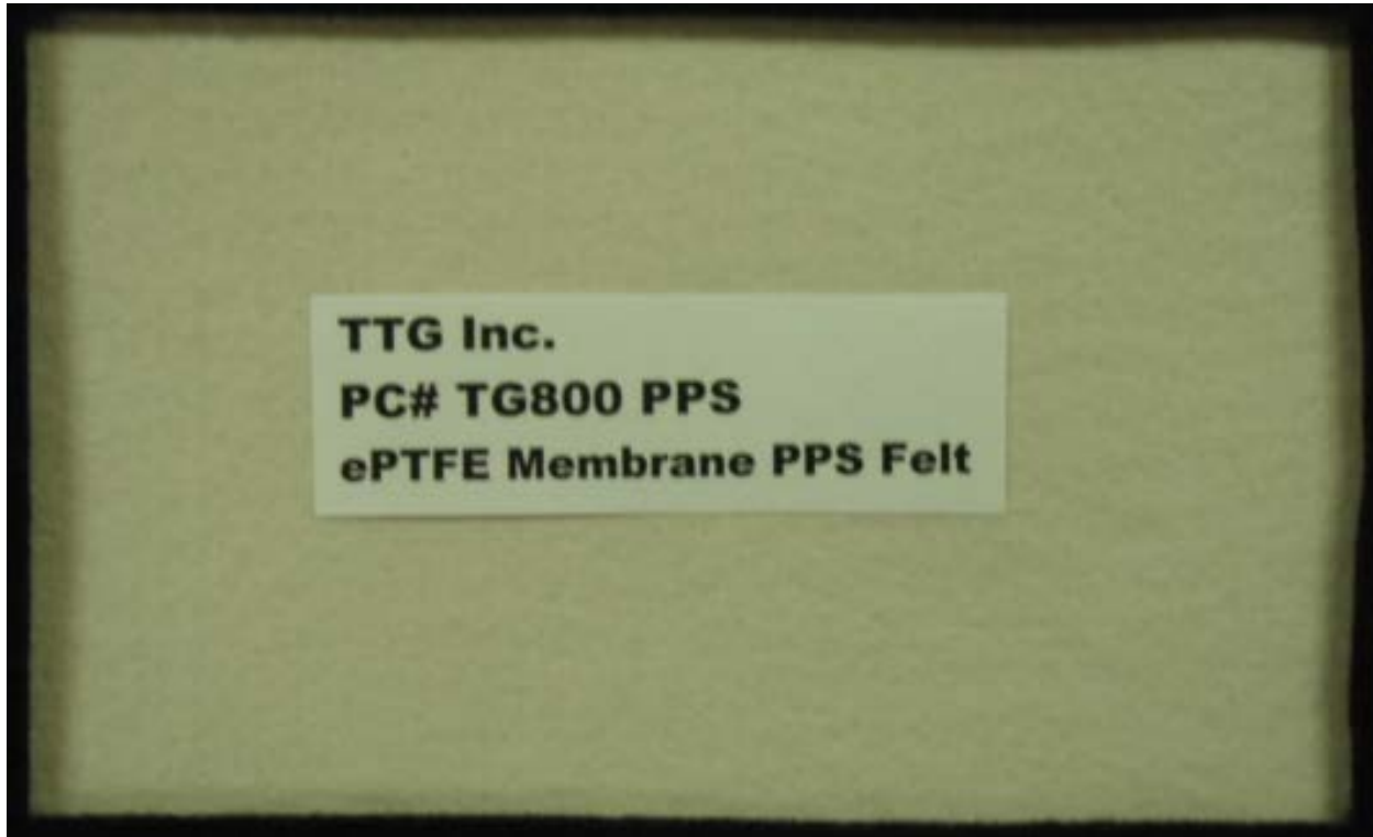
Figure 1. Photograph of TTG Inc.'s TG800 filtration media

TTG Inc. provided the following information about their filter media product. The TTG Inc. TG800 filtration media is a 16 ounces per square yard (oz/yd 2 ) scrim-supported polyphenylene sulfide (PPS) felt laminated with an ePTFE (expanded polytetrafluoroethylene) membrane. Figure 1 is a photograph of the fabric. Sample material was received as nine 46 x 91 cm (18 x 36 in.) swatches marked with the manufacturer's model number, year and month of manufacture, and cake side (the upstream side of the fabric, which is exposed to the particle-laden air on which the filter cake builds up). Three of the swatches were selected at random for preparing three circular test specimens 150 mm (5.9 in.) in diameter.