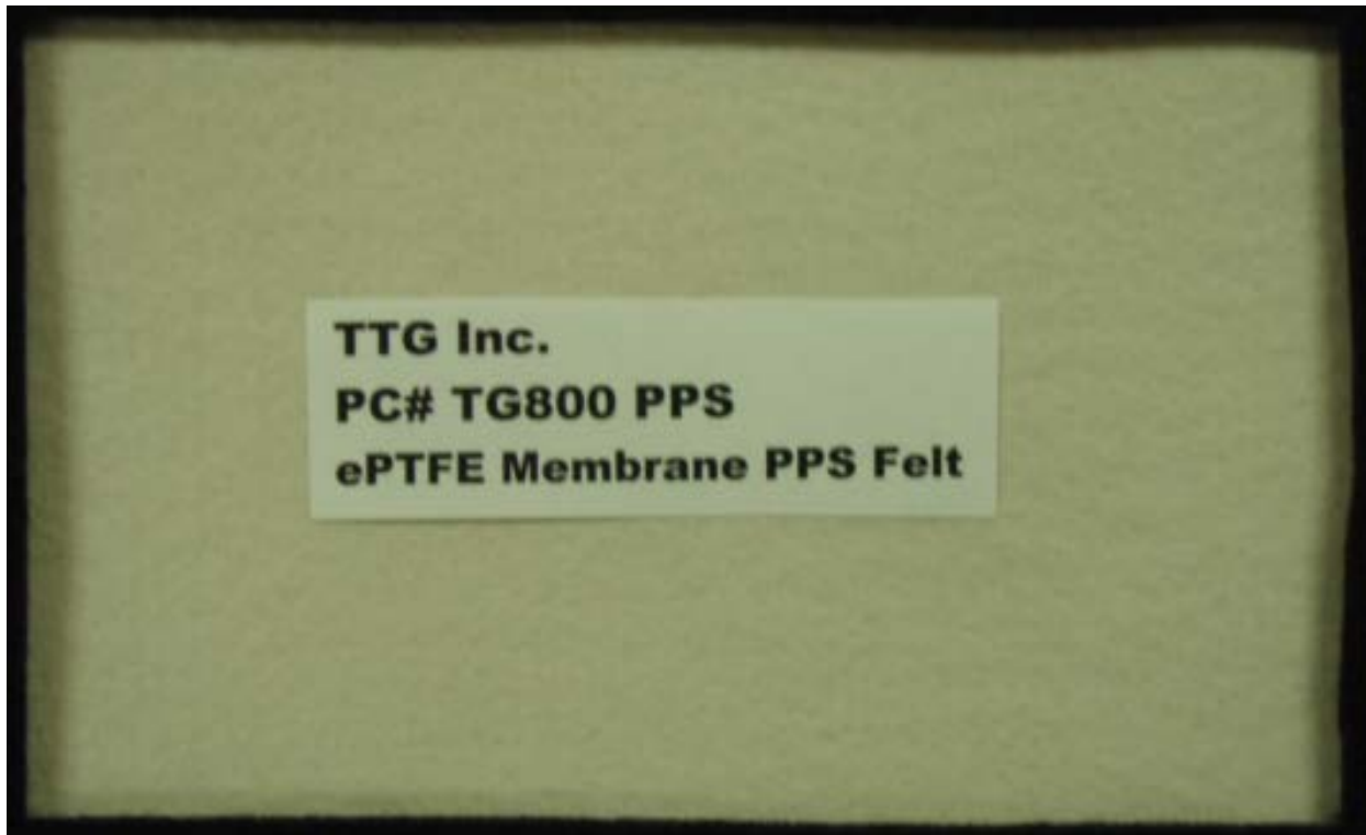
Figure 2. Photograph of TTG Inc.'s TG800 filtration media.

The TTG Inc. TG800 filtration media is a 16 ounces per square yard (oz/yd 2 ) scrim supported polyphenylene sulfide (PPS) felt laminated with an ePTFE (expanded polytetrafluoroethylene) membrane. Figure 2 is a photograph of the fabric. Sample material was received as nine 46 x 91 cm (18 x 36 in.) swatches marked with the manufacturer's model number, year and month of manufacture, and cake side (the upstream side of the fabric, which is exposed to the particle-laden air, on which the filter cake builds up). Three of the swatches were selected at random for preparing three circular test specimens 150 mm (5.9 in.) in diameter.