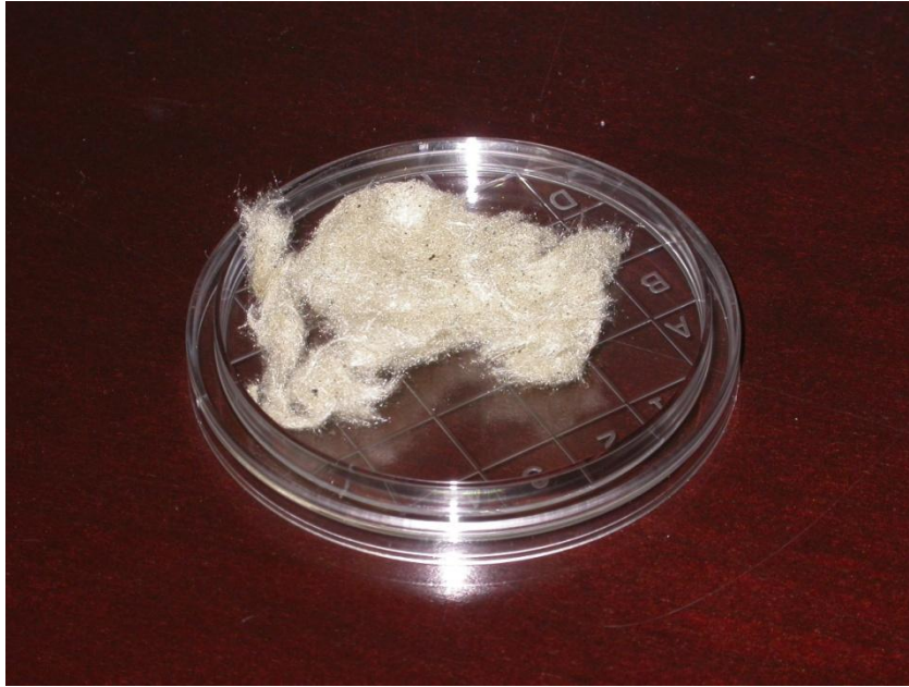
Figure S-1. Premium Plus™ Rockwool Insulation

Figure S-1 shows a representative piece of the material.