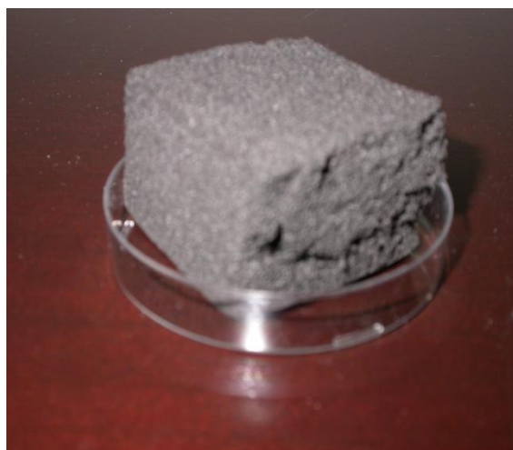
Figure S-2. Bottom (inner) surface of material