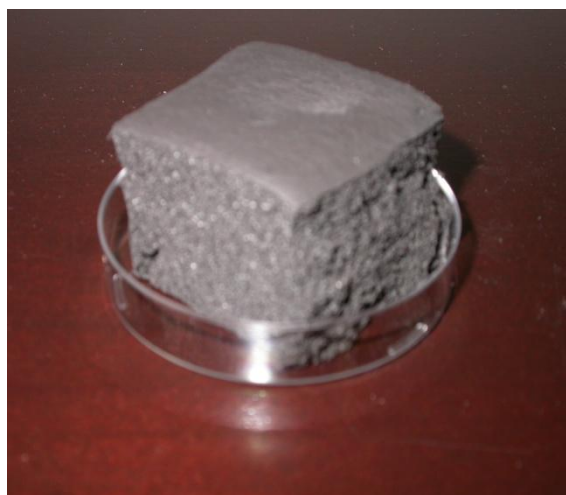
Figure S-1. Top (outer) surface of material

Figures 2-1 and 2-2 show the top and bottom surfaces of the material.