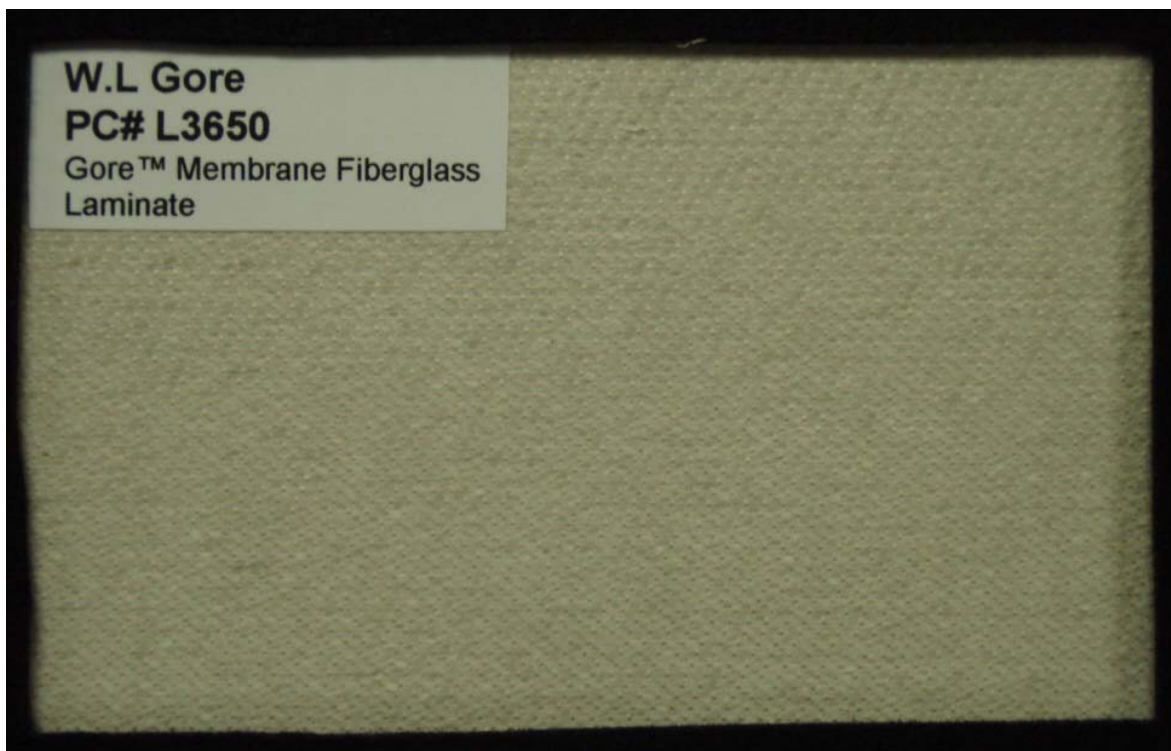
Figure 1. Photograph of W.L. Gore & Associates, Inc.'s L3650 filtration media.