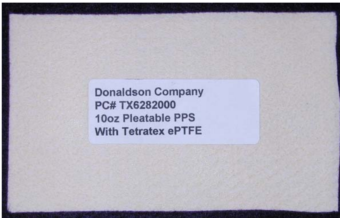
Figure 1. Photograph of Donaldson Company, Inc.'s 6282 Filtration Media