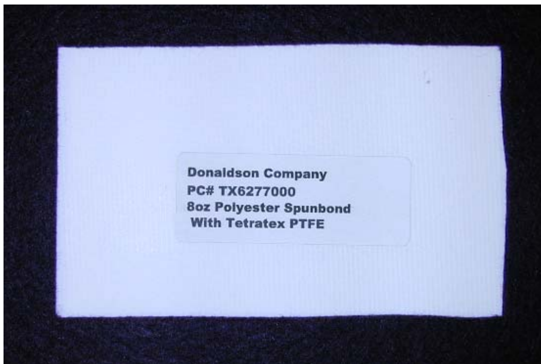
Figure 1. Photograph of Donaldson Company, Inc.'s 6277 filtration media