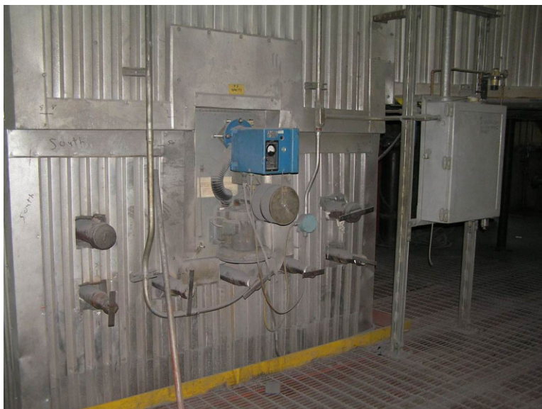
Figure 2-2. Emission Testing Ports for MP-5

Since both boilers exhaust through a common stack, emission testing for this program was conducted in the ductwork of the selected boiler upstream of the stack. The testing location and ports are shown in Figure 2-2.