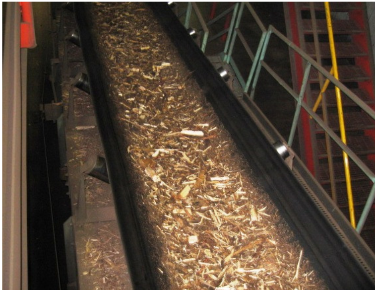
Figure 2-3. Rapids Energy Woody biomass Feed

Waste wood and bark from the neighboring Blandin Paper mill, as well as waste wood from other local facilities, was co-fired with coal during this verification. The fuels (woody biomass and coal) are conveyed to the boiler separately and mixed on the stoker. Figure 2-3 shows the woody biomass conveyor during verification testing.