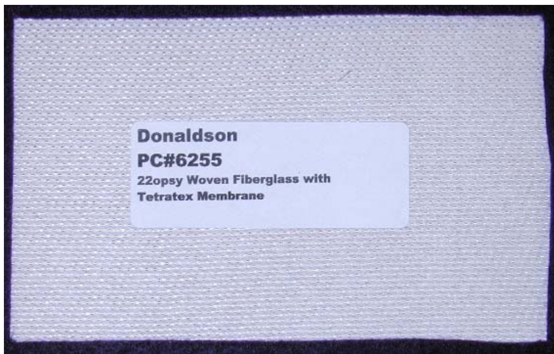
Figure 1. Photograph of Donaldson Company, Inc.'s 6255 Filtration Media