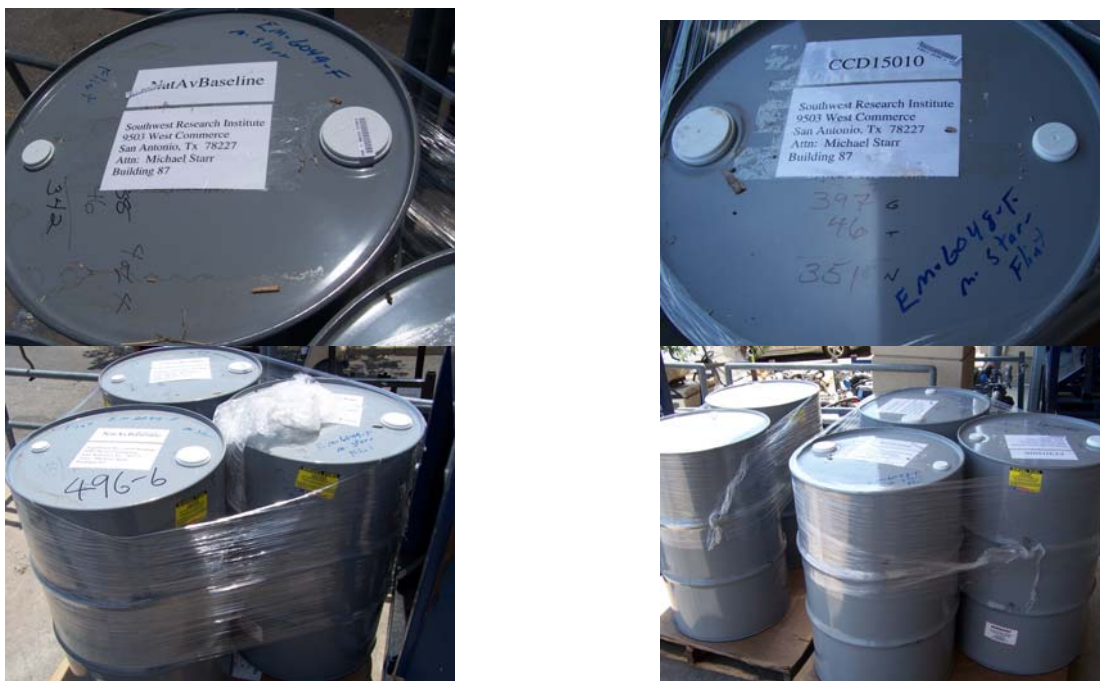
Figure 1. Sealed drums of Flint Hills Resources diesel fuels

Emissions were quantified with two separate diesel fuels, a baseline fuel and a candidate fuel. FHR palletized approximately 200 gallons of both fuels for transport to SwRI in sealed 55-gallon drums. As shown in Figure 1, drums of baseline fuel were labeled “NatAvBaseline” (coded by SwRI as EM-6049-F), and drums of candidate fuel were labeled “CCD15010” (coded by SwRI as EM-6048-F). SwRI extracted a one-gallon sample of the baseline and candidate fuels for chemical analyses. The composition and properties of the CCD15010 fuel and the composition and concentration of the HiTEC4121 additive in the fuel are proprietary and will be provided to the EPA National Clean Diesel Campaign (NCDC) and to the Texas Council on Environmental Quality (TCEQ) as confidential business information. The properties of the baseline fuel are given in Table 1.