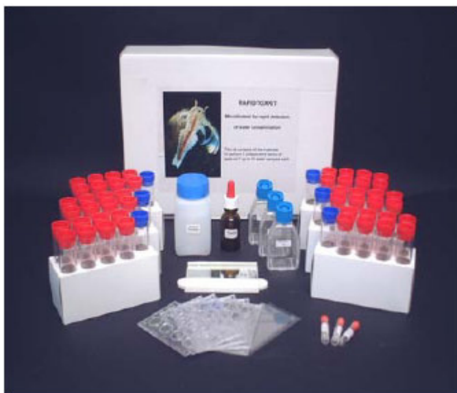
Figure 2-1. Strategic Diagnostics Inc. RAPIDTOXKIT

The objective of the ETV AMS Center is to verify the performance characteristics of environmental monitoring technologies for air, water, and soil. This verification report provides results for the verification testing of the RAPIDTOXKIT. Following is a description of the RAPIDTOXKIT, based on information provided by the vendor. The information provided below was not verified in this test.