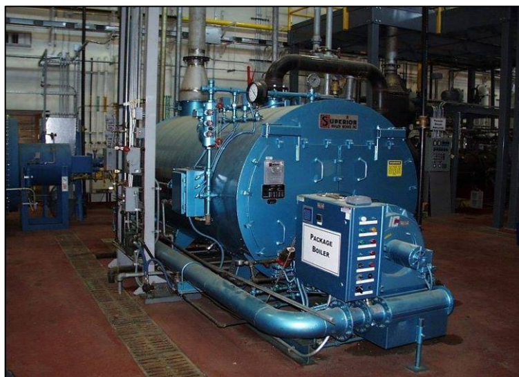
Figure 3-1. Wetback Scotch Marine Package Boiler

A 2.94 thousand British thermal unit per hour, 3-Pass Wetback Scotch Marine Package Boiler (SMPB), manufactured by Superior Boiler Works, Inc., and located at the EPA RTP facility, was used for the verification test. This boiler (Figure 3-1) is capable of firing natural gas or a variety of fuel oils. In this test, the oil burner was used; this burner is a low-pressure, air-atomizing nozzle that delivered a fine spray at an angle that ensured proper mixing with the air stream. The