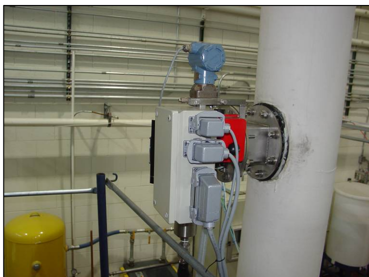
Figure 3-3. Installed DioxinMonitoringSystem Sampling Probe

Figure 3-3 shows the DioxinMonitoringSystem sampling unit on the duct. Immediately prior to each test run, a PUF sampling cartridge was installed in the DioxinMonitoringSystem sampling unit. During the verification test, the DioxinMonitoringSystem was