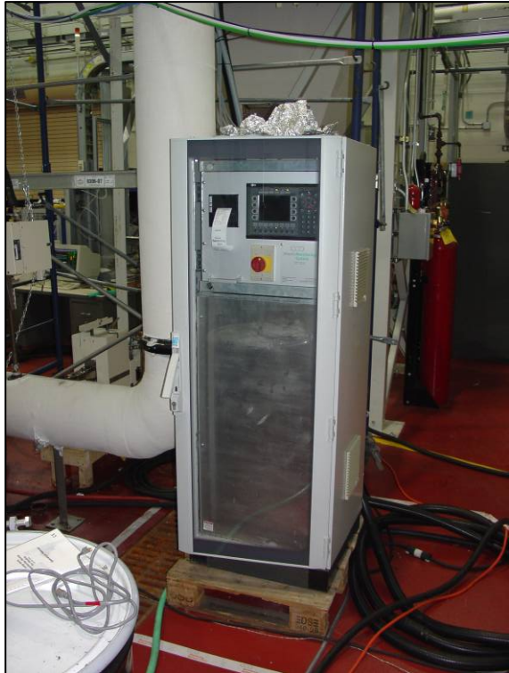
Figure 3-4. Dioxin Monitoring System Control Unit