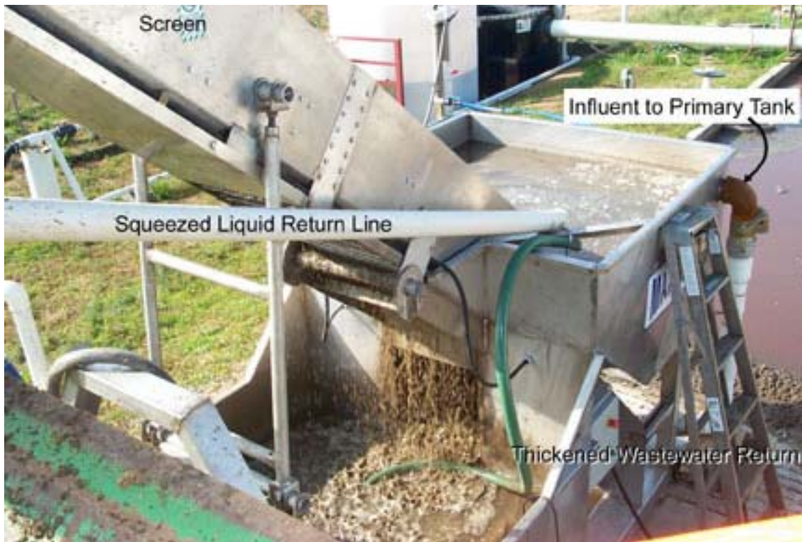
Figure 3-1. Maximizer MAX 1016 in operation at test site.

started for shakedown testing. Shakedown testing continued through February 4, 2003, while the vendor adjusted the operating conditions and final adjustments were made to control the flow rate at 80 gallons per minute. Although the unit was ready for testing on February 5 th , cold weather, rain, ice and weather-related equipment problems delayed the first test day until February 12, 2003. Figure 3-1 shows the Maximizer installed at the test site.