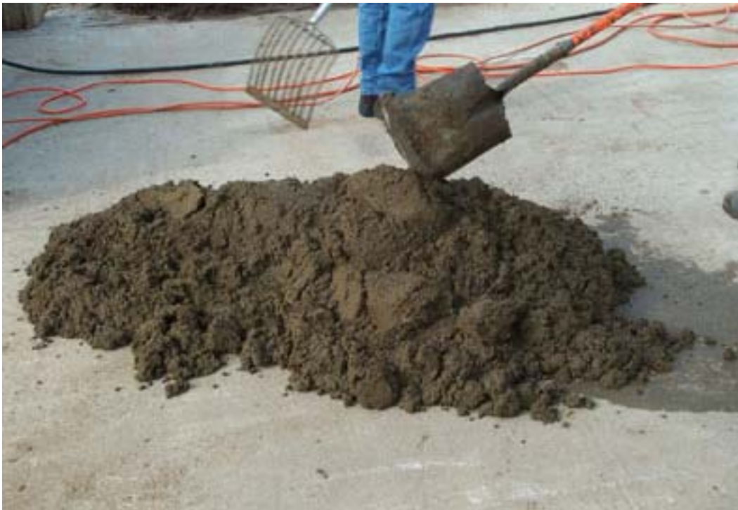
Figure 3-3. Recovered Solids from Maximizer are mixed prior to sampling.

Influent and effluent samples were taken using separate sampling containers of at least 500 mL capacity suspended on a pole approximately two feet below the wastewater surface. The samples were transferred immediately to labeled plastic sample bottles provided by the Environmental Analysis Laboratory. Duplicate analyses for QA/QC purposes were taken from the same sample bottle at the laboratory, by laboratory staff.