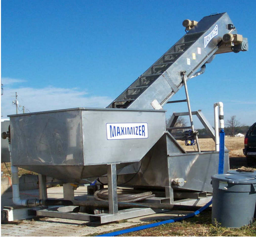
Figure 2-1. Brome Agri Sales Ltd Maximizer Separator, MAX 1016.