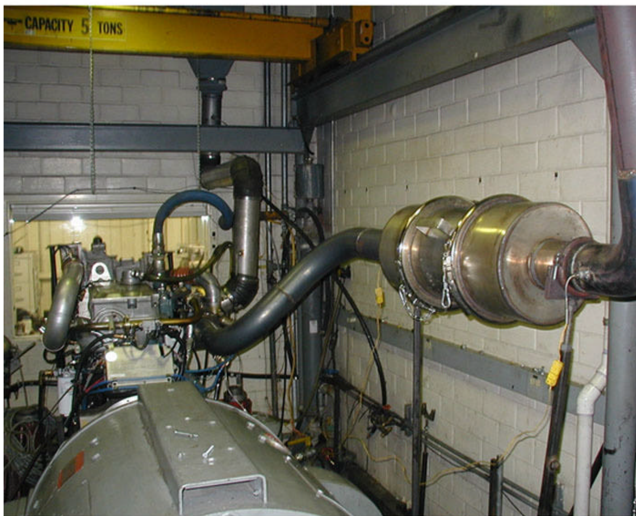
Figure 2. Mounting of Purifier on the DDC engine in Test Cell 4