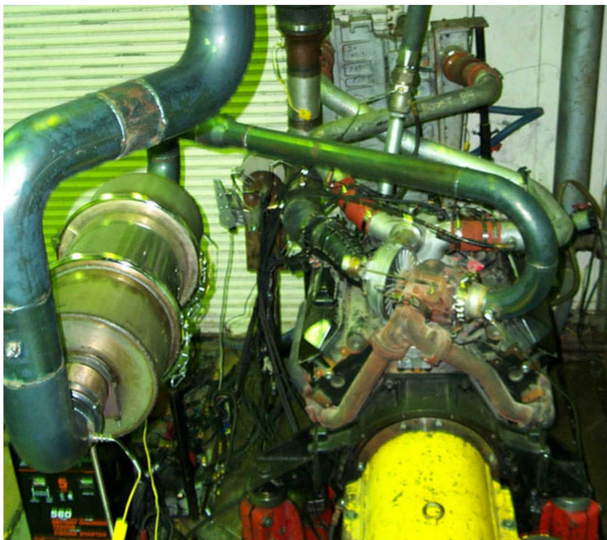
Figure 1. Mounting of Purifilter on the Navistar engine in Test Cell 4