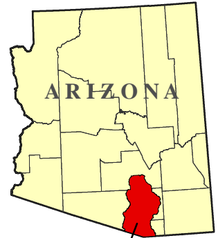
Upper Santa Cruz & Avra Basin