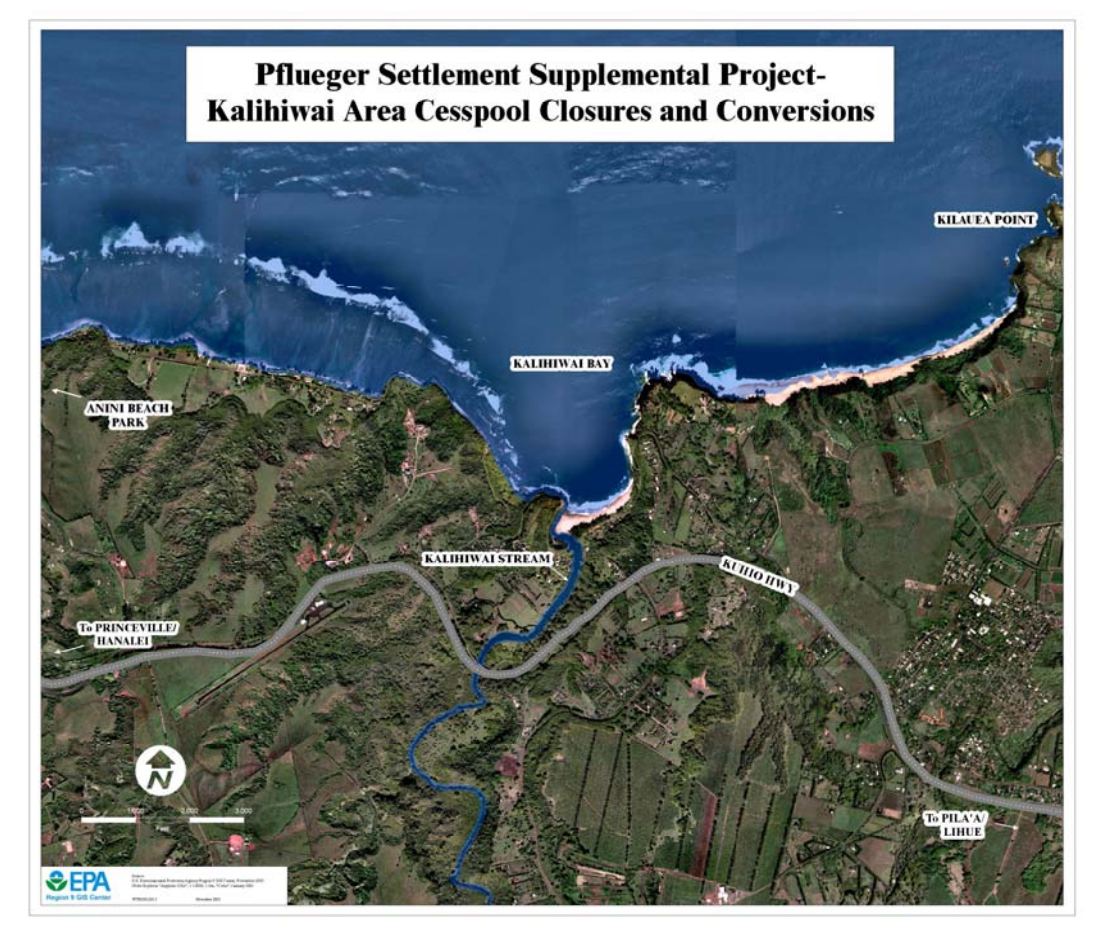
Figure 3. Aerial photo showing Kalihiwai beach and stream where cesspool closures and conversions will be done as a Supplemental Environmental Project.