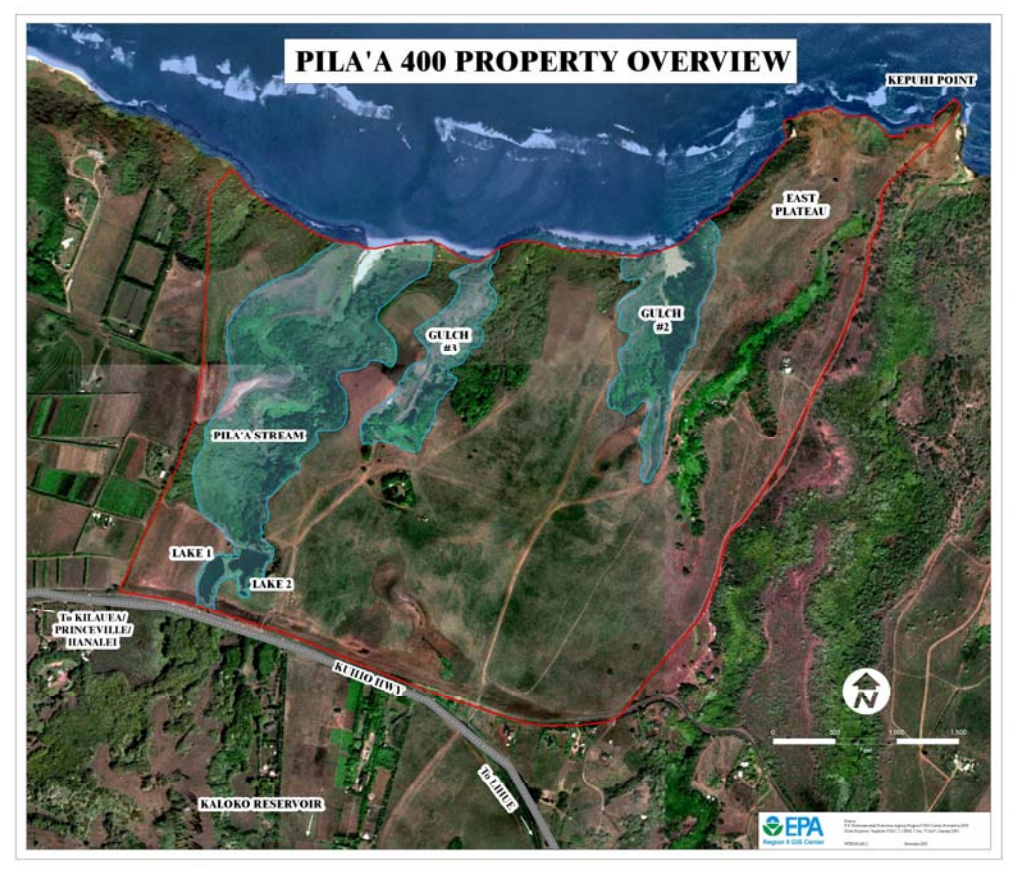
Figure 2. Aerial overview of Pila'a property showing locations of Gulch 2, Gulch 3, Pila'a Stream, and Eastern Plateau where stabilization and restoration work will be done.

<u>Injunctive Relief</u>: In order to repair damage caused by Mr. Pflueger's unauthorized construction, work valued at approximately $5.3 Million is required under the settlement. The primary components of this work are overall site stabilization to prevent further erosion and restoration of stream segments at three sites on the property. (See Figure 2.)