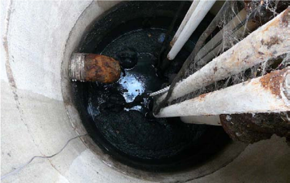
Oakland Photo 9: Denton Place PS wet well.