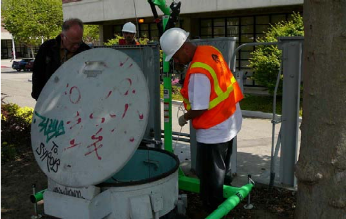
Oakland Photo 7: Laney PS.