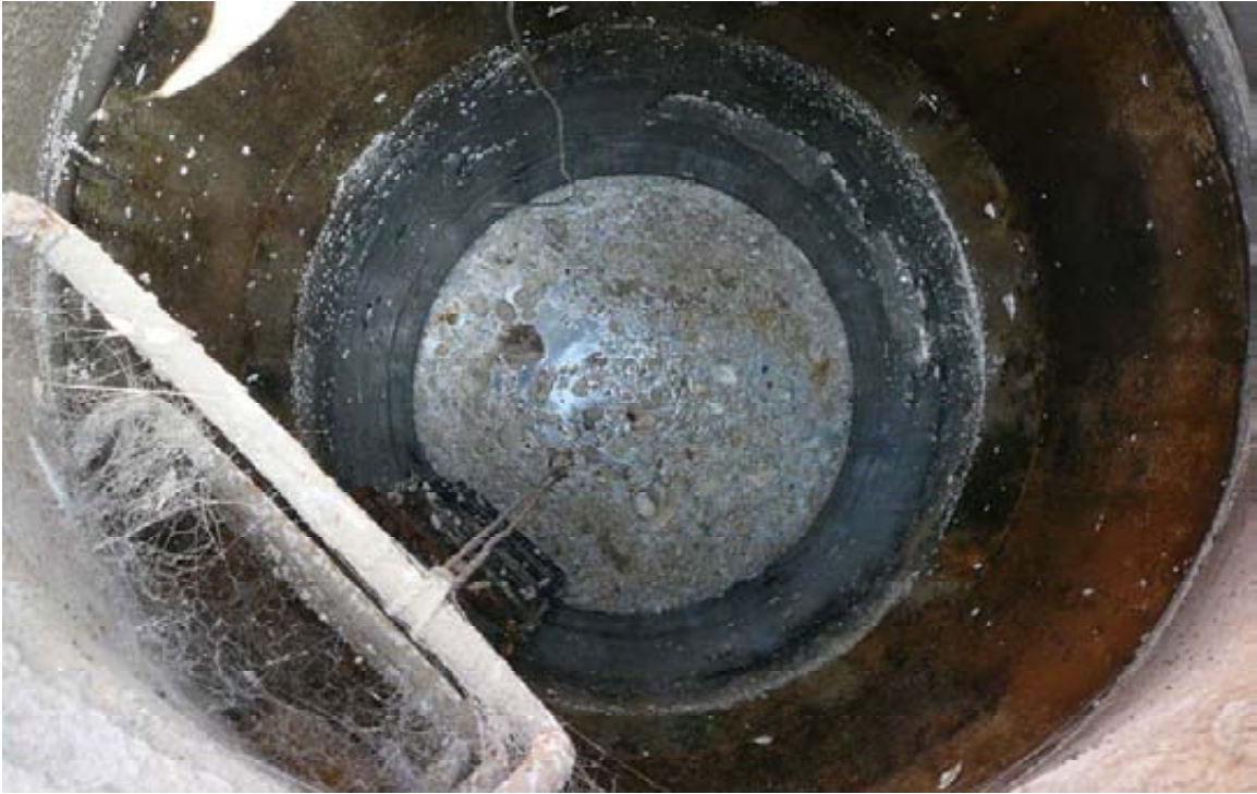
Oakland Photo 5: Tidewater PS wet well.