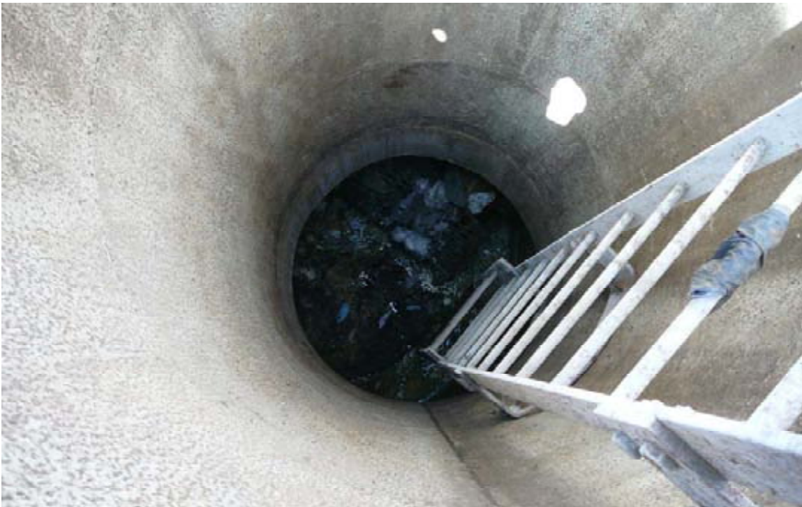
Oakland Photo 8: Laney PS wet well.