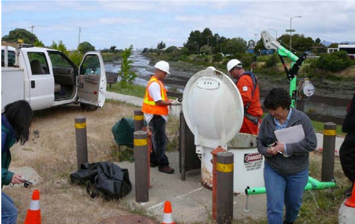
Oakland Photo 1: Hegenberger PS