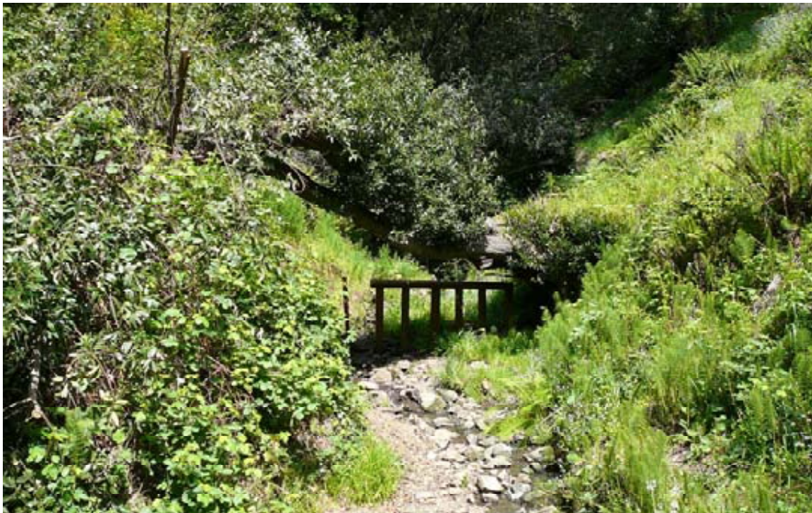
Oakland Photo 12: 2108 Mastlands SSO site.