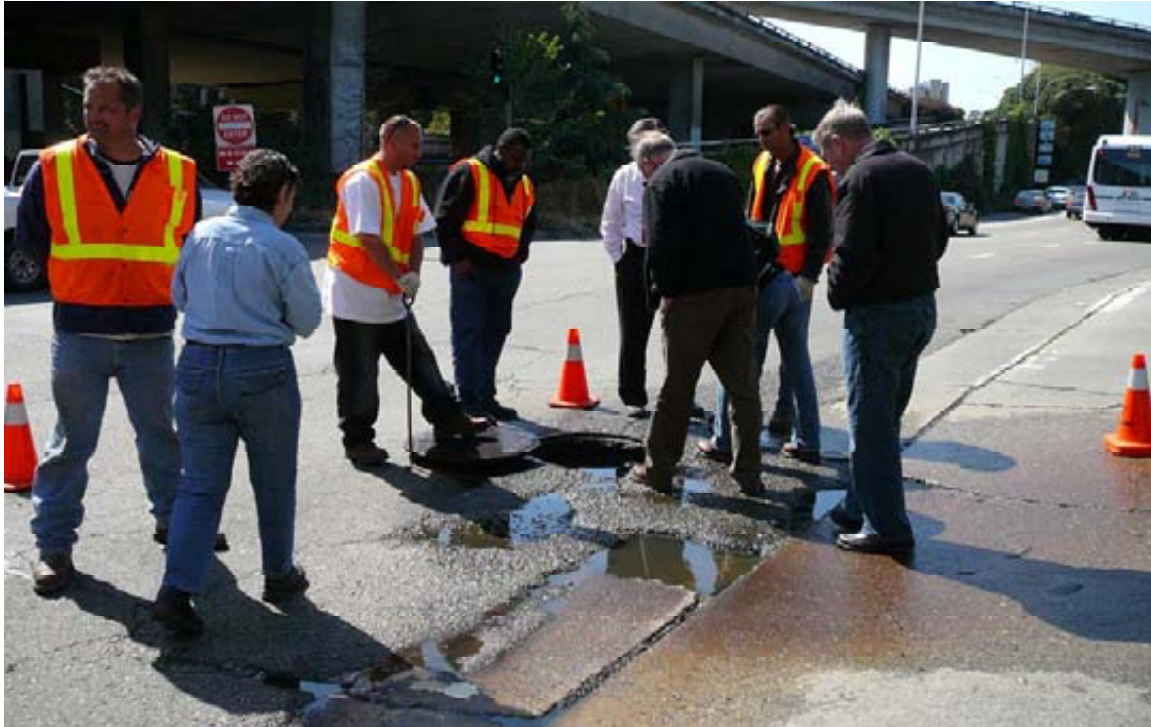
Oakland Photo 15: Santa Clara and Oakland Avenue event.