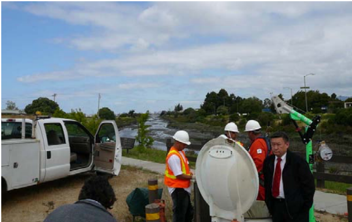
Oakland Photo 2: Hegenberger PS