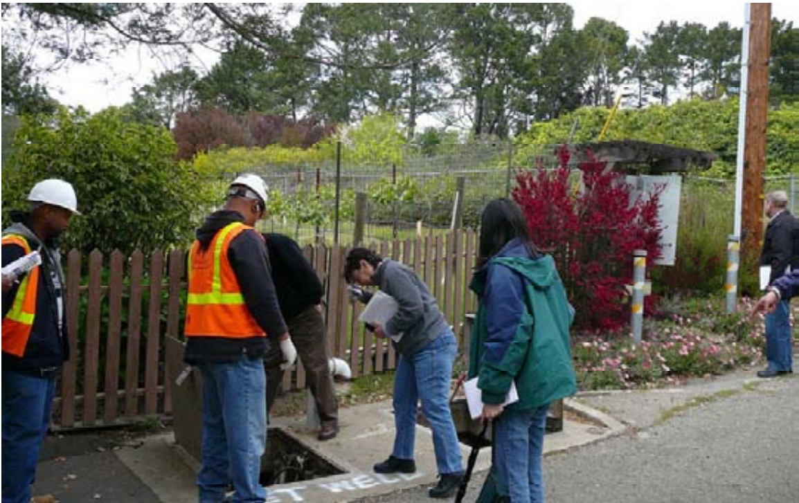
Oakland Photo 10: Denton Place PS.