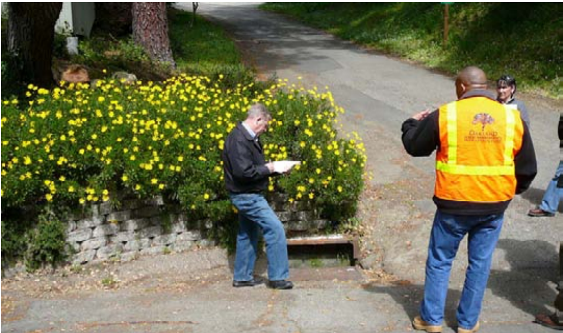
Oakland Photo 14: 2108 Mastlands SSO site - storm drain inlet where spill would have gone.