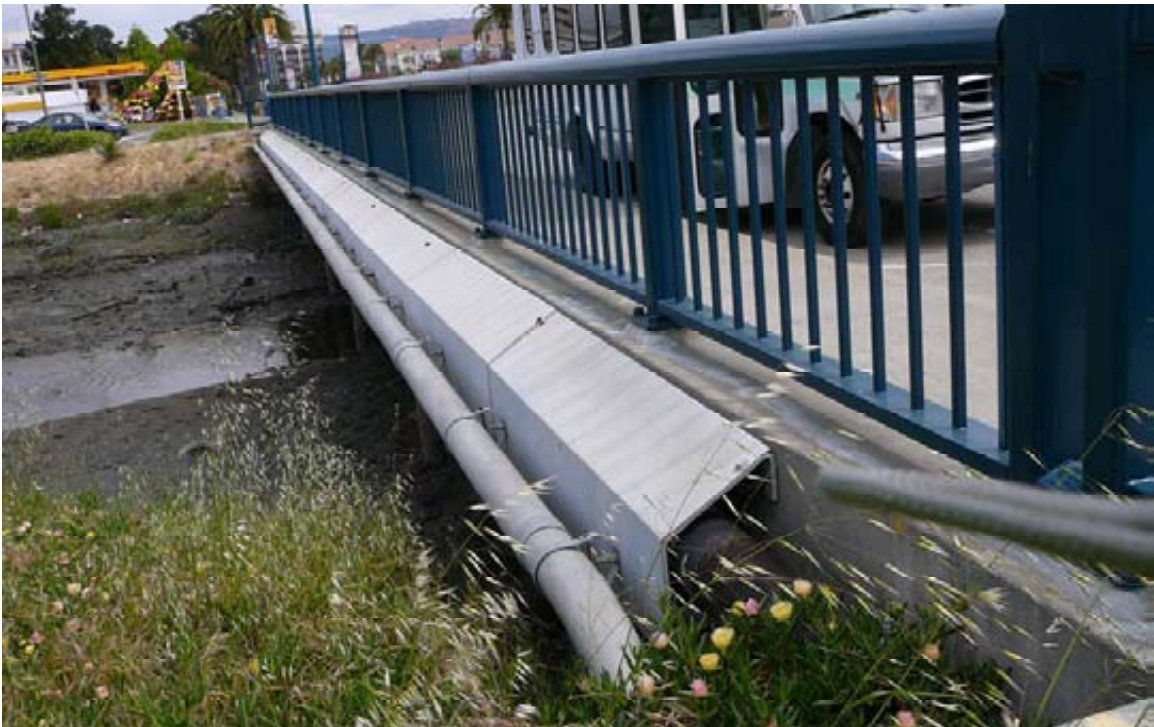
Oakland Photo 4: Hegenberger PS force main at bridge