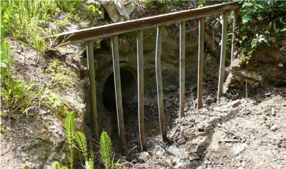
Oakland Photo 13: 2108 Mastlands SSO site - creek goes underground here.