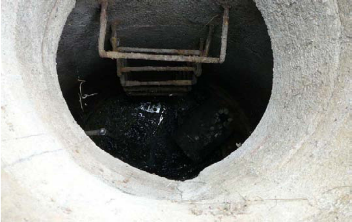
Oakland Photo 3: Hegenberger PS wet well