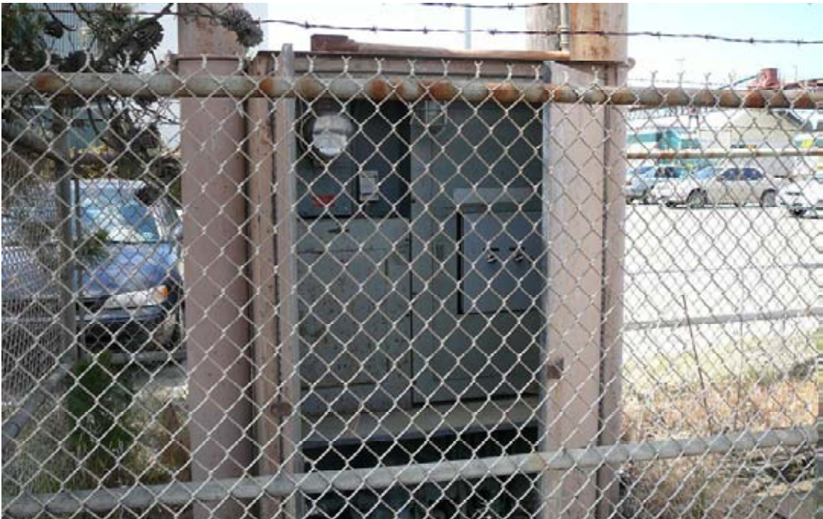
Oakland Photo 6: Tidewater PS pump controls.