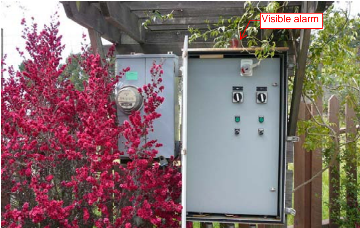
Oakland Photo 11: Denton Place PS pump controls and visible alarm.