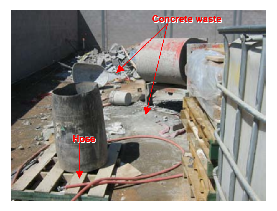
Photograph 17: Mesa Municipal Court Concrete waste and washout hose located near mixer