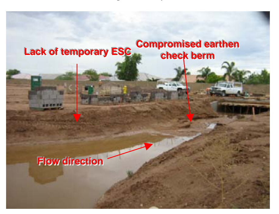
Photograph 4: Mountain View Village Center

Earthen check berm consisting of unconsolidated fill had been placed within the drainage channel and was compromised by a recent flow event