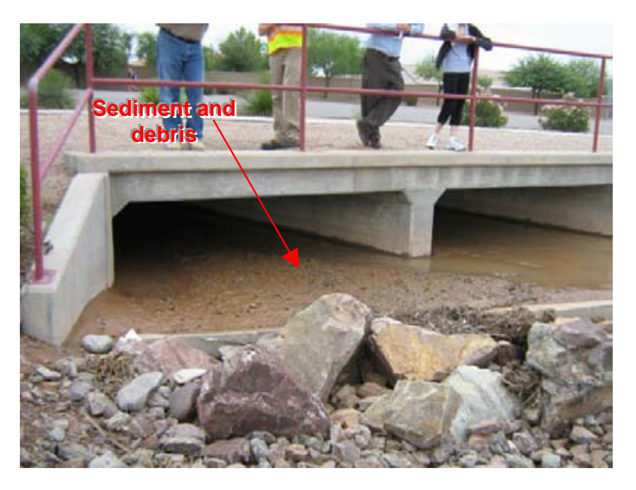
Photograph 7: Mountain View Village Center Sediment and debris were observed in the drainage channel above the flow control structure