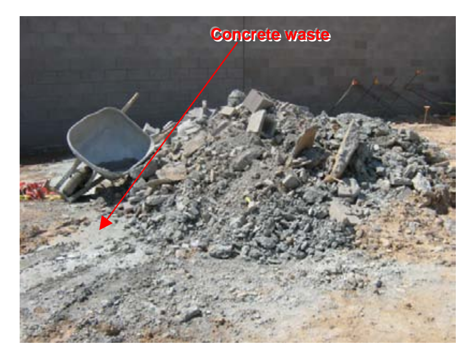
Photograph 18: Mesa Municipal Court Close-up view of concrete waste shown in background of Photograph 17