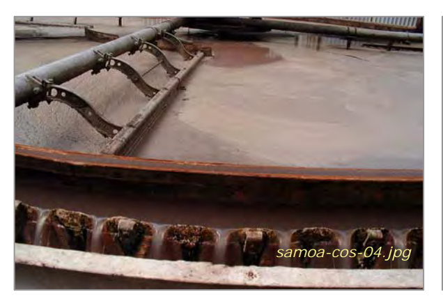
Photo #3: Low-Strength Wastewater - DAF Unit