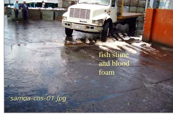
Photo #2: Harbor Dock - Fish Slime from Thawing