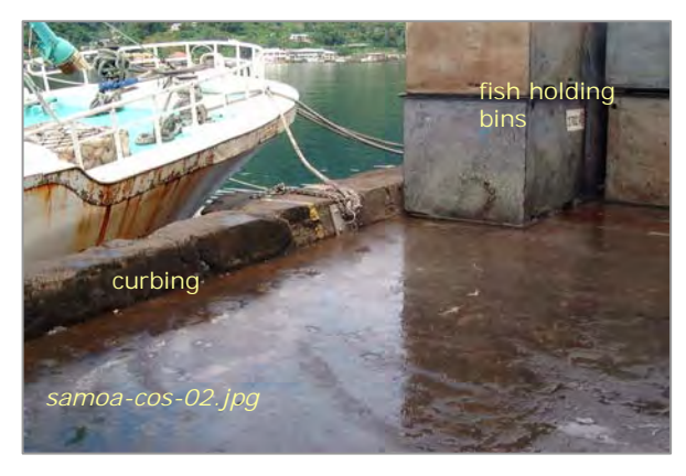
Photo #1: Harbor Dock - Shows Curbing / Washdown

Nine of the 11 digital photographs taken during this inspection and one of 21 taken from Starkist are depicted here in this section. The COS Samoa photographs are saved as samoacos-01.jpg through -11.jpg . The Starkist photograph is saved as samoa-starkist-14.jpg .