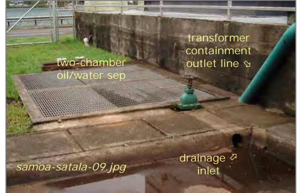
Photo #6: NPDES Sump #2 – Transformer Inlet Date: 04/01/08