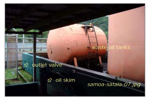
Photo #3: NPDES Sump #1 – Waste Oil Tanks Date: 04/01/08