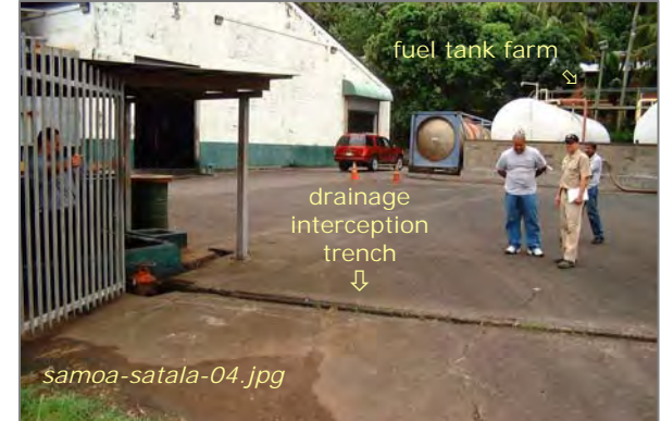
Photo #1: Cooling Towers and Paved Access Areas Date: 04/01/08