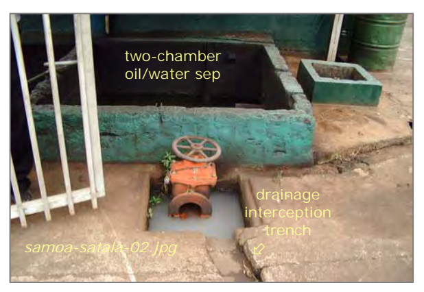
Photo #5: NPDES Sump #1 – Soapy Drainage Date: 04/01/08