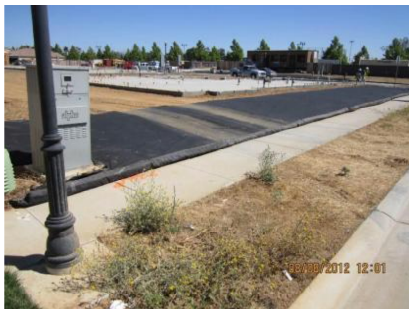
Photograph 2. View of area with geotextile coverage that was used for vehicle access.