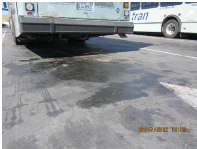
Photograph 10. Closer view of staining shown in Photograph 9.