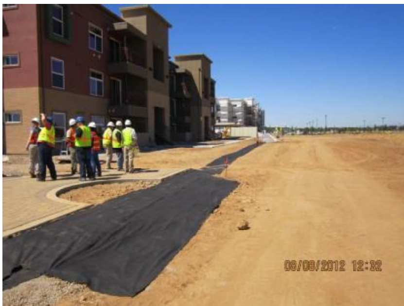
Photograph 2. View looking west of northern perimeter of the construction site. Note that BMPs had not been installed for perimeter control.