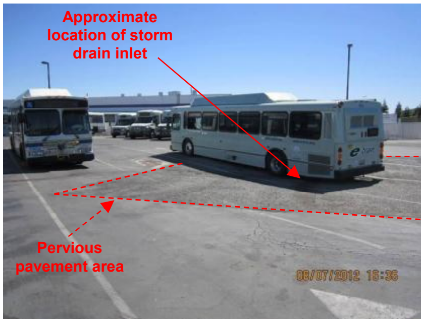
Photograph 6. View of bus parked over a storm drain inlet in an area of pervious pavement.