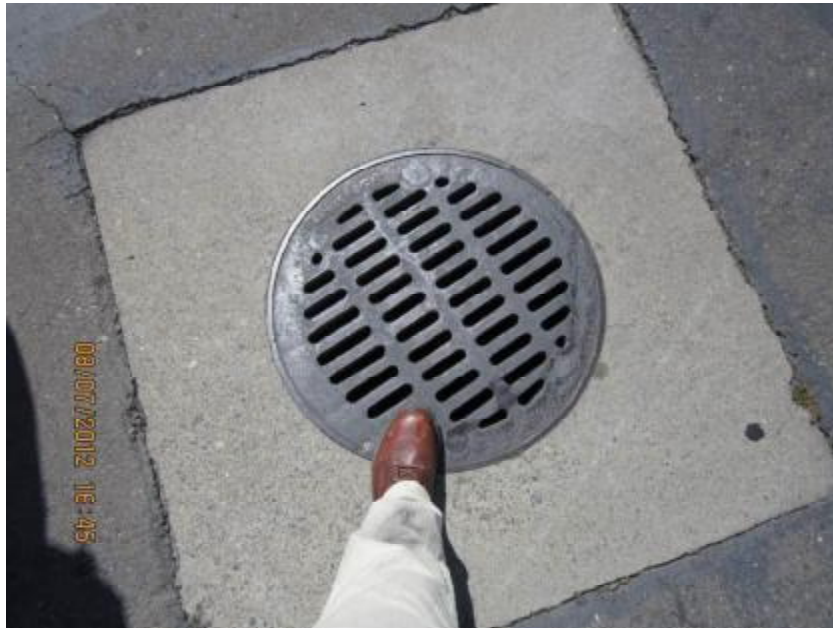
Photograph 11. View of storm drain inlet without BMPs for inlet protection.