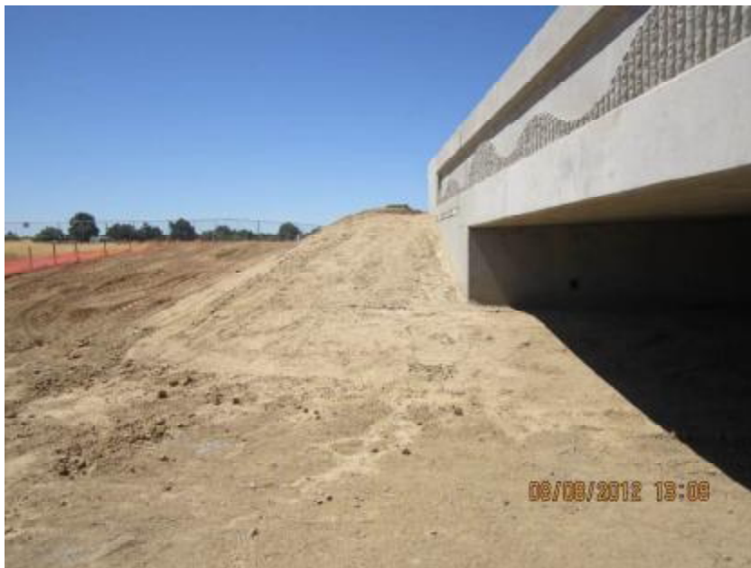
Photograph 4. Longleaf Drive Bridge Construction Project – View of south abutment on west side of the bridge. Note lack of erosion and sediment control BMPs.