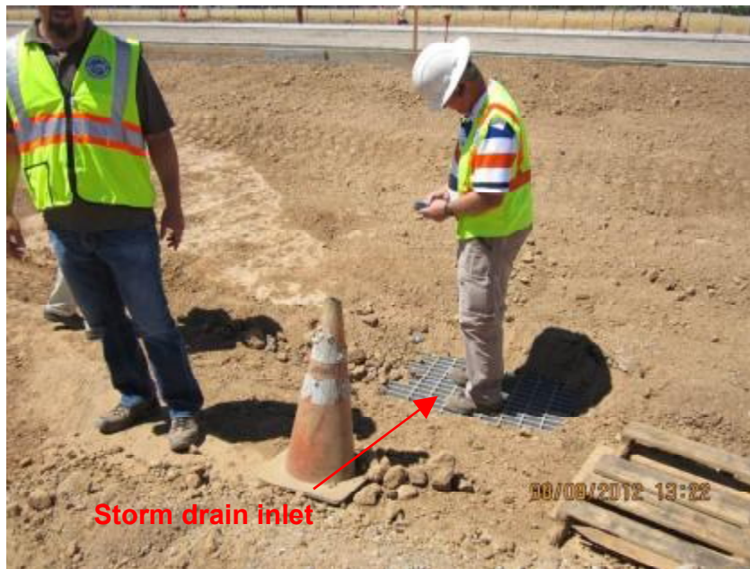
Photograph 6. Laguna Corporate Center Construction Project – View of storm drain inlet without inlet protection along south side of the roadway extension construction from the bridge.