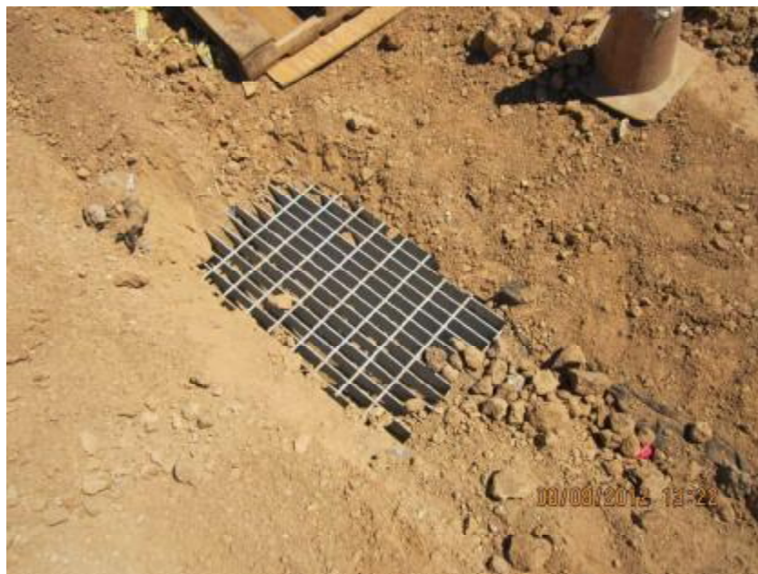
Photograph 7. Laguna Corporate Center Construction Project – Close-up view of storm drain inlet shown in Photograph 6.