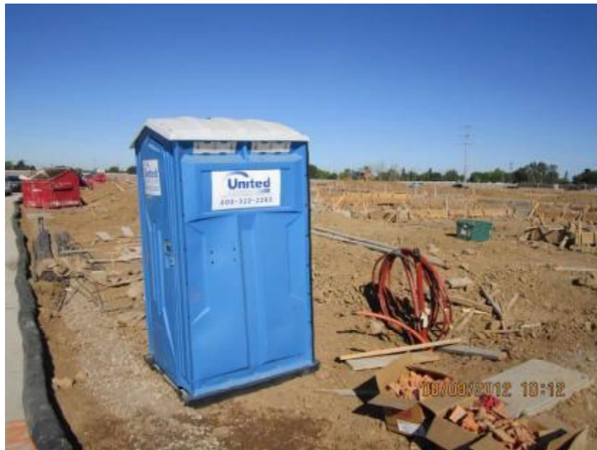
Photograph 4. View of an additional portable toilet at the site which was not staked into the ground or otherwise secured.