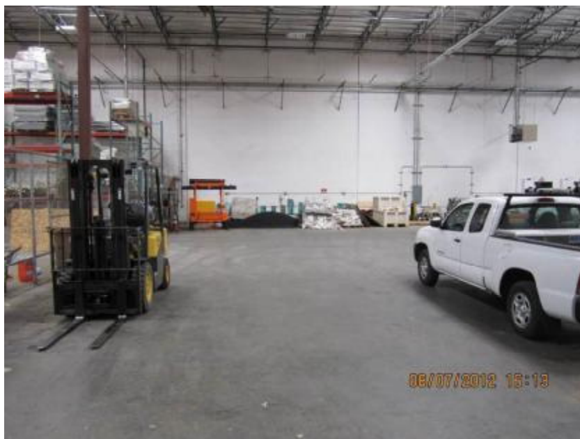
Photograph 2. View of portion of warehouse used for storage.