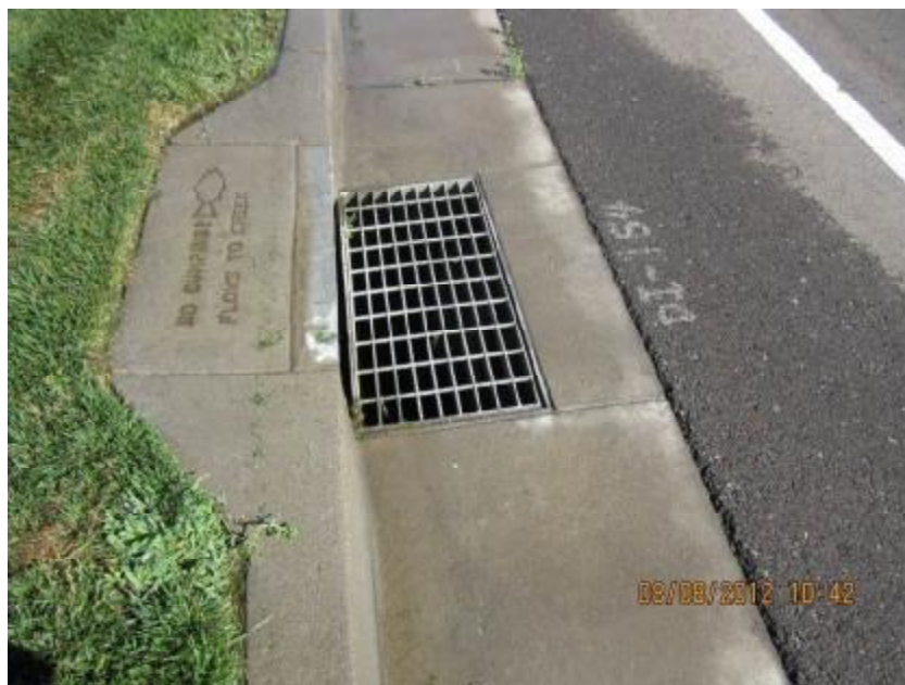
Photograph 6. Close-up view of storm drain inlet noted in Photograph 5. Note wetted area surrounding inlet.