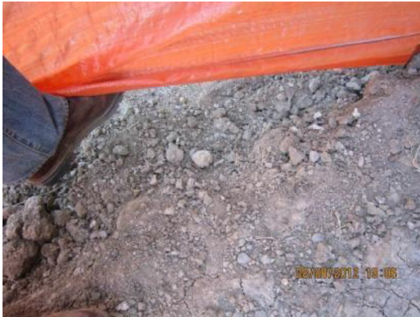
Photograph 3. Longleaf Drive Bridge Construction Project – Additional view of silt fence shown in Photographs 1 and 2 that was not entrenched into the ground.