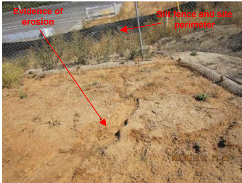
Photograph 5. View of straw wattle BMPs and silt fence BMP installed near the northeast corner of the site. Note evidence of erosion in foreground of the photograph.