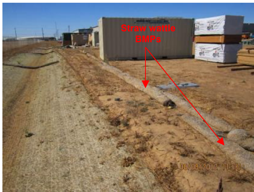
Photograph 3. View of straw wattle BMPs installed along the eastern edge of the site. Note that the straw wattles were not entrenched into the ground.