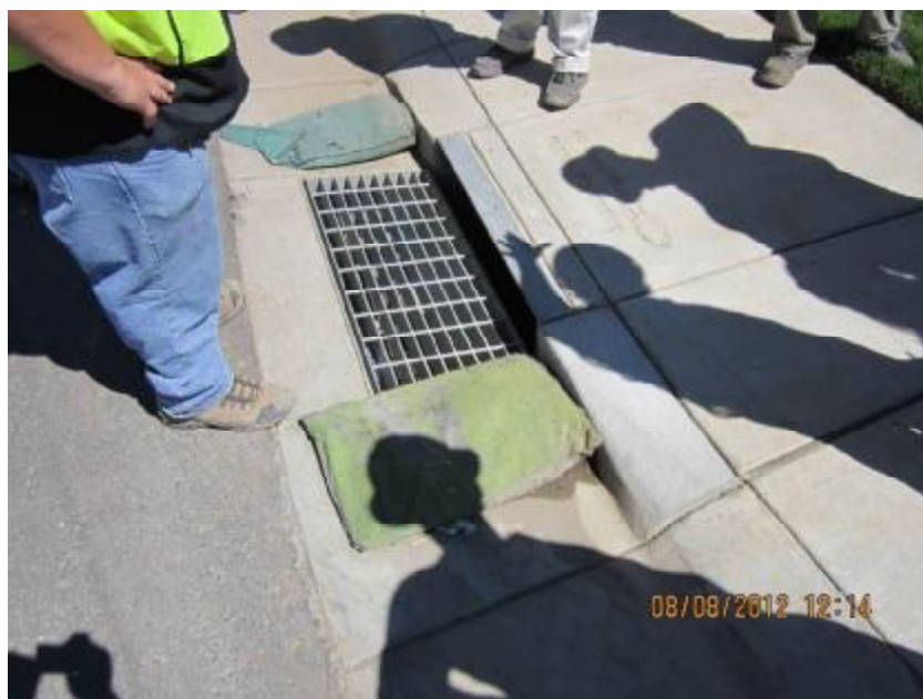
Photograph 4. View of deteriorated gravel bags used for storm drain inlet protection.