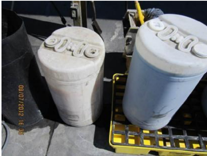
Photograph 5. View of drum of unlabeled container of fluid stored in an uncovered area without secondary containment adjacent to the vehicle wash bay shown in Photograph 4.