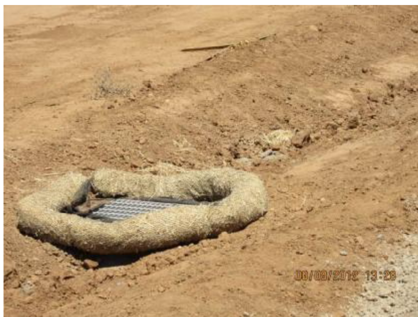
Photograph 8. Laguna Corporate Center Construction Project – View of storm drain inlet in parking lot area surrounded by straw wattles which were not entrenched into the ground.