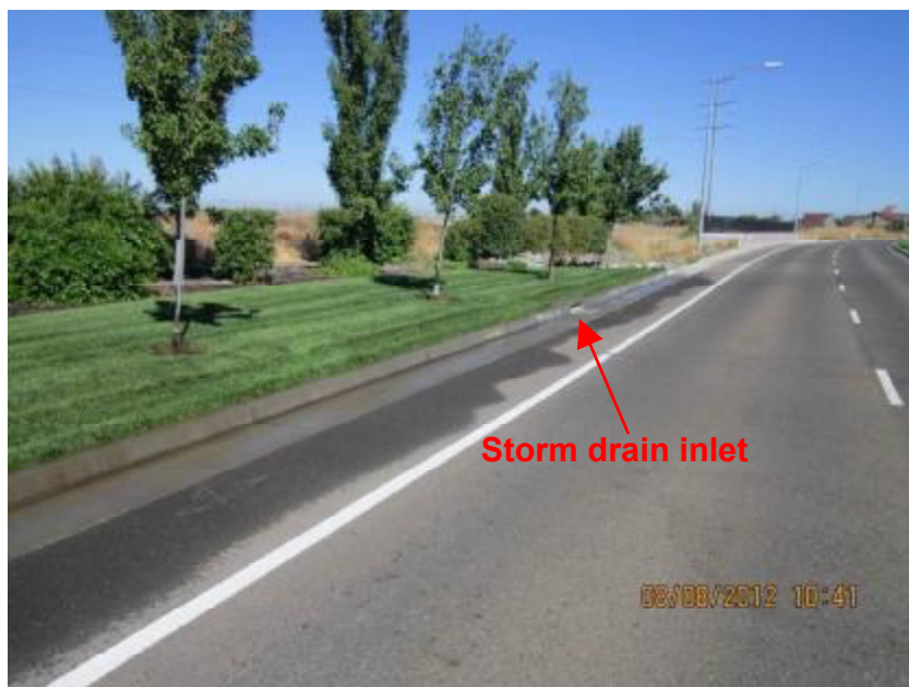
Photograph 5. View of turf area along roadway upgradient of outfall. Note evidence of irrigation flows to the curb and gutter.