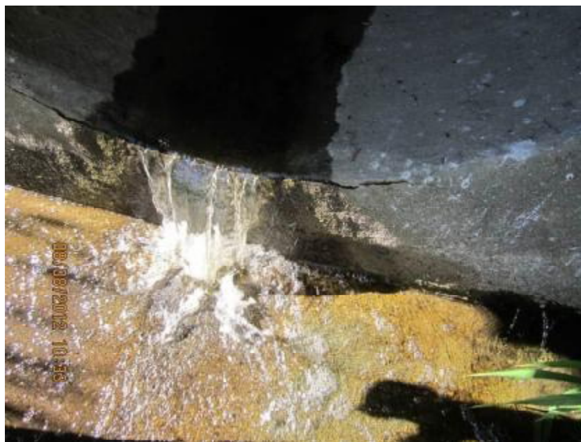
Photograph 4. Close-up view of dry weather flow from outfall.