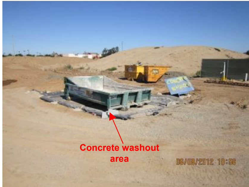
Photograph 1. View of concrete washout area at the construction site.