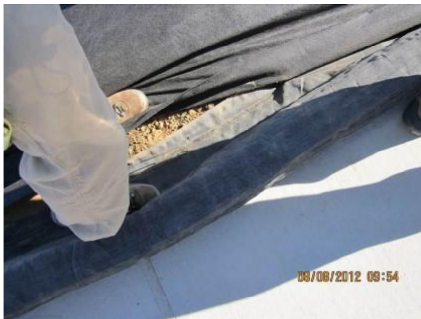
Photograph 2. View of “heavy weight wattle” sediment control BMP which was not entrenched into the ground.