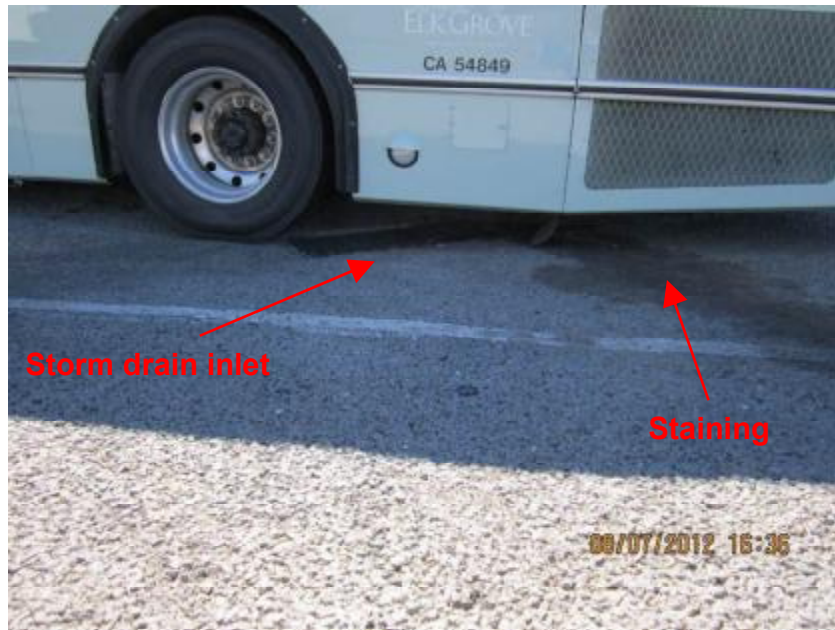
Photograph 7. Closer view of storm drain inlet referenced in Photograph 6.