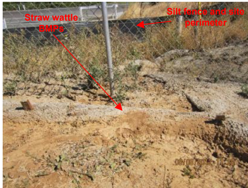
Photograph 6. Close-up view of straw wattle which had accumulated sediment to its full height.