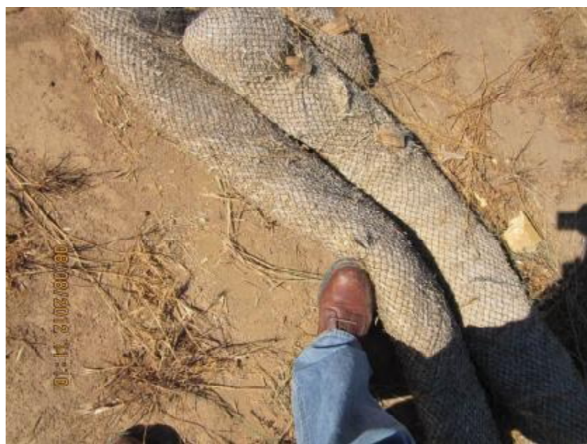
Photograph 4. Close-up view of straw wattles along the eastern edge of the site which were not entrenched into the ground.