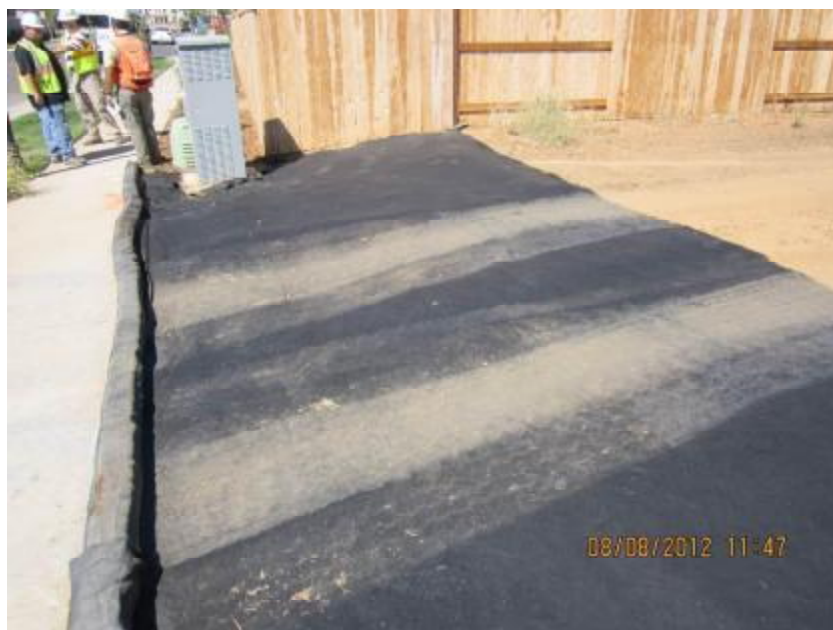
Photograph 3. Close-up view of area used for vehicle access shown in Photograph 2.