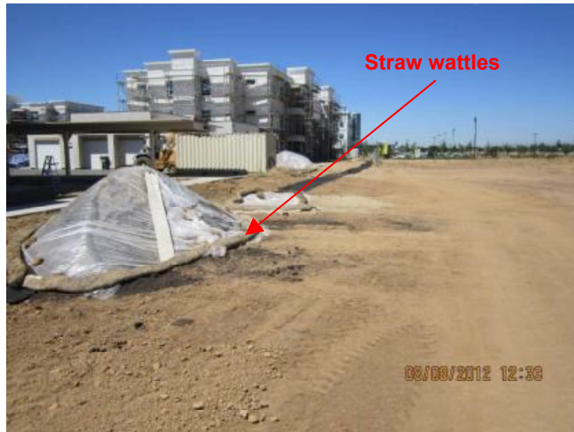
Photograph 3. View of stockpile along northern perimeter of the construction site. Note that the straw wattles placed around the stockpile were not entrenched into the ground.