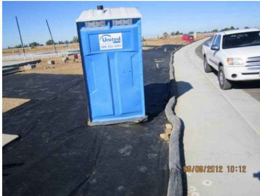
Photograph 3. View of portable toilet at the site which was not staked into the ground or otherwise secured.