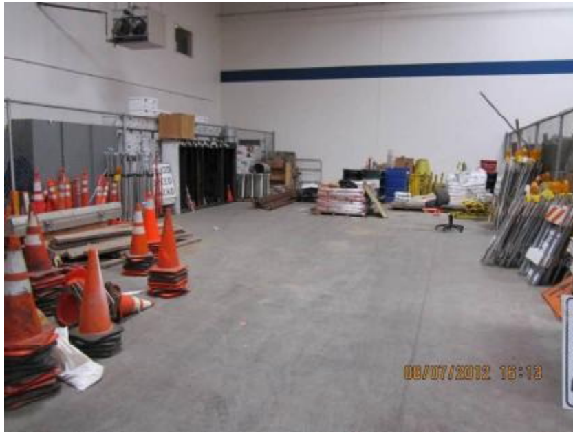
Photograph 3. Additional view of portion of warehouse used for storage.