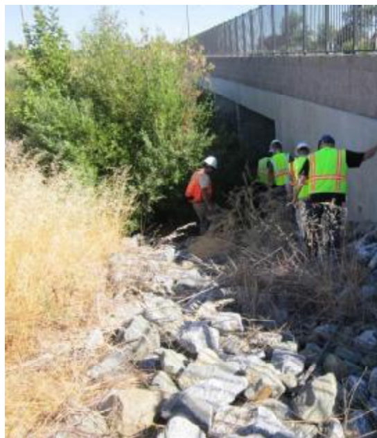
Photograph 1. View of access route to outfall.