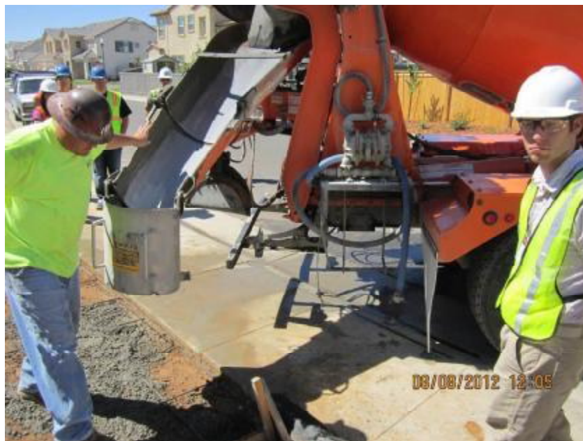
Photograph 5. View of contractor demonstrating how the “self-contained” cleaning procedure functioned on his concrete truck.