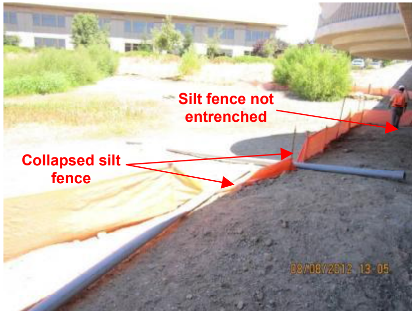
Photograph 1. Longleaf Drive Bridge Construction Project – View of area below the bridge where there was a section of collapsed silt fence and a section of silt fence that was not entrenched into the ground.