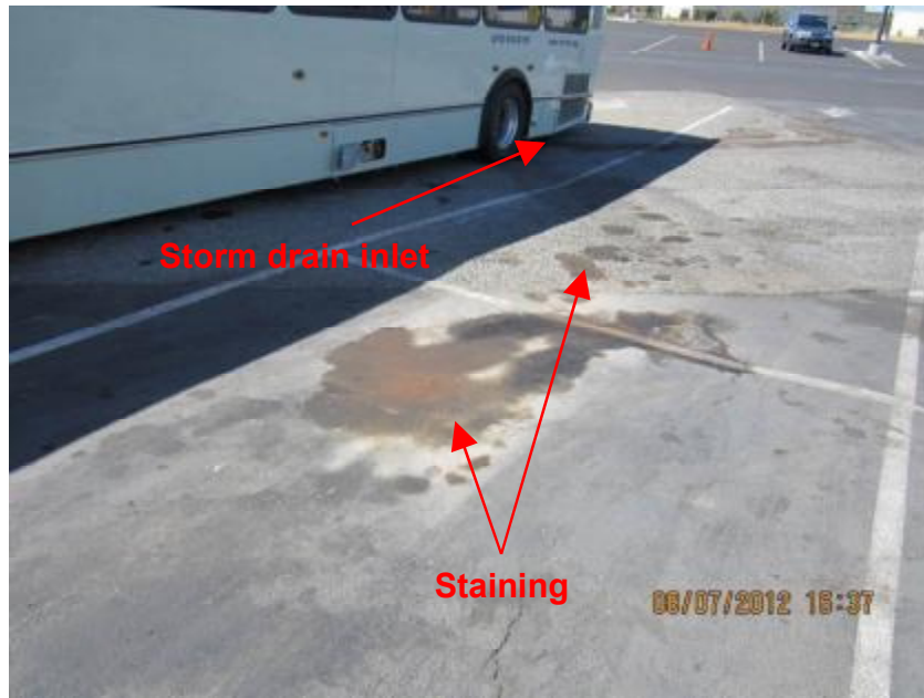
Photograph 8. View of staining on pervious and impervious ground surface upgradient of storm drain inlet shown in Photographs 6 and 7.