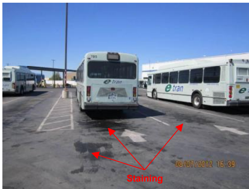
Photograph 9. Example of staining on impervious ground surface in bus storage and parking area.