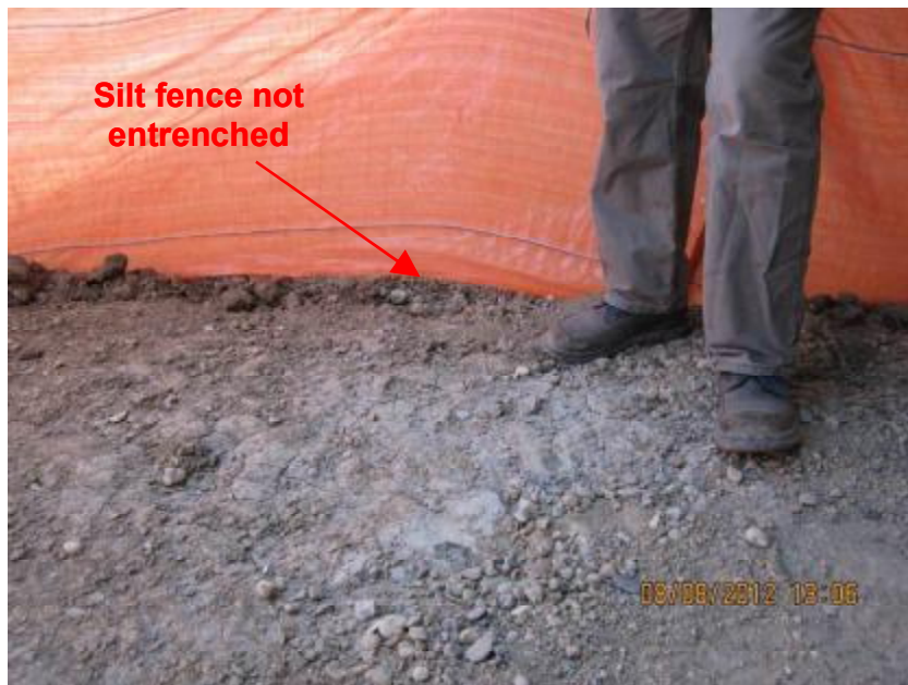
Photograph 2. Longleaf Drive Bridge Construction Project – Closer view of section of silt fence that was not entrenched into the ground noted in Photograph 1.