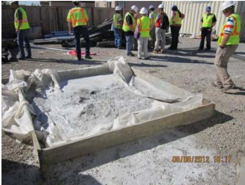
Photograph 5. View of concrete washout area at the site. Note concrete waste material located adjacent to the washout containment structure.