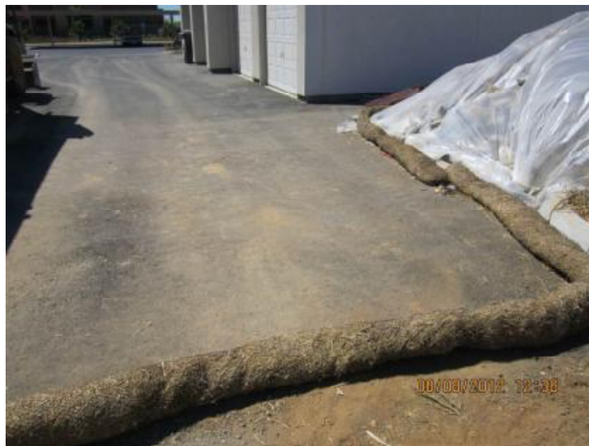
Photograph 4. Additional example of stockpile surrounded by straw wattles which were not entrenched into the ground.