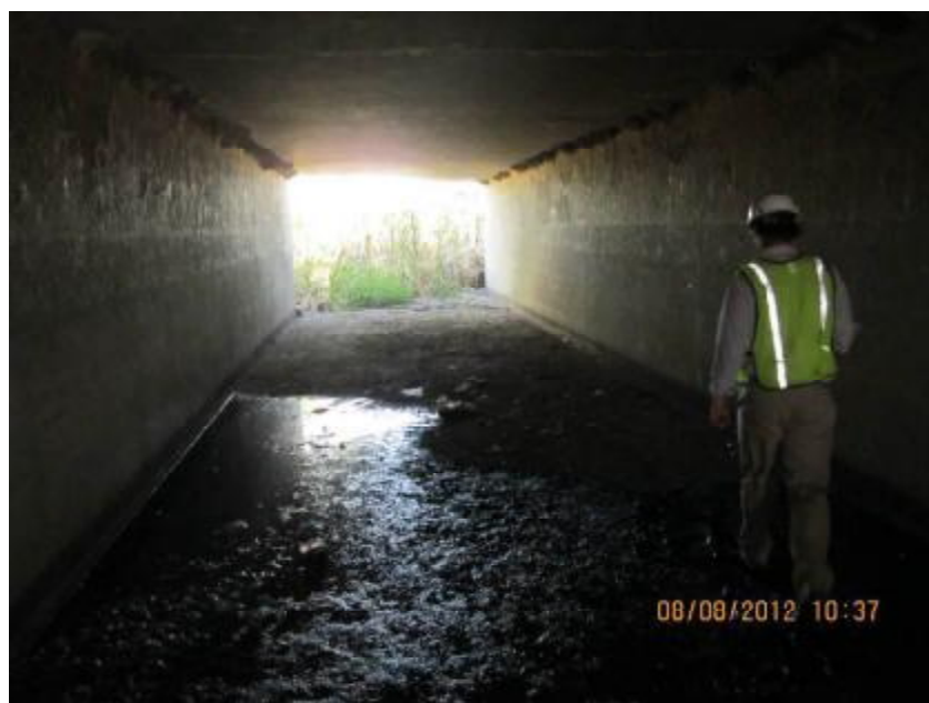
Photograph 2. View of box culvert access to outfall.