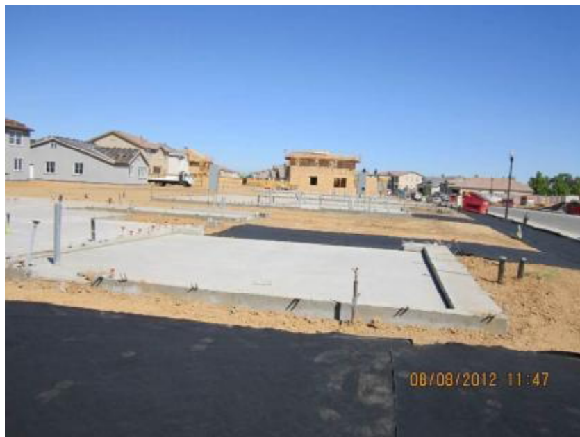
Photograph 1. View of lots with geotextile fabric applied around the perimeter of an active lot.