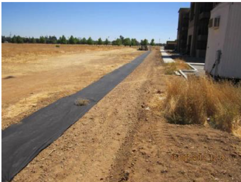
Photograph 1. View looking east of northern perimeter of the construction site. Note that BMPs had not been installed for perimeter control.