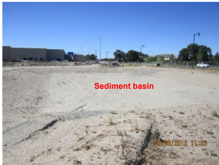
Photograph 2. View of temporary sediment basin near the northwest corner of the site.