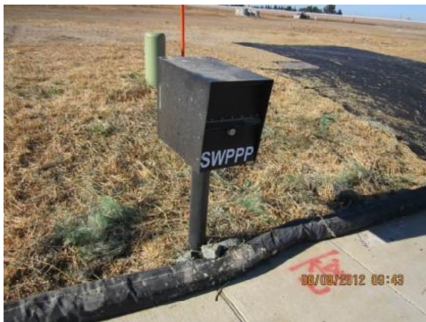
Photograph 1. View of container at construction site for the project's SWPPP.