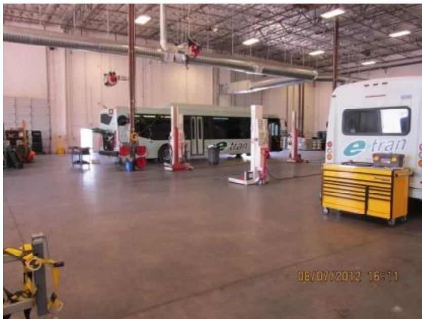
Photograph 1. View of portion of warehouse used for vehicle maintenance.