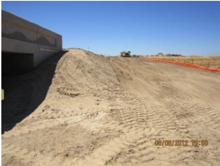
Photograph 5. Longleaf Drive Bridge Construction Project – View of north abutment on west side of the bridge. Note lack of erosion and sediment control BMPs.