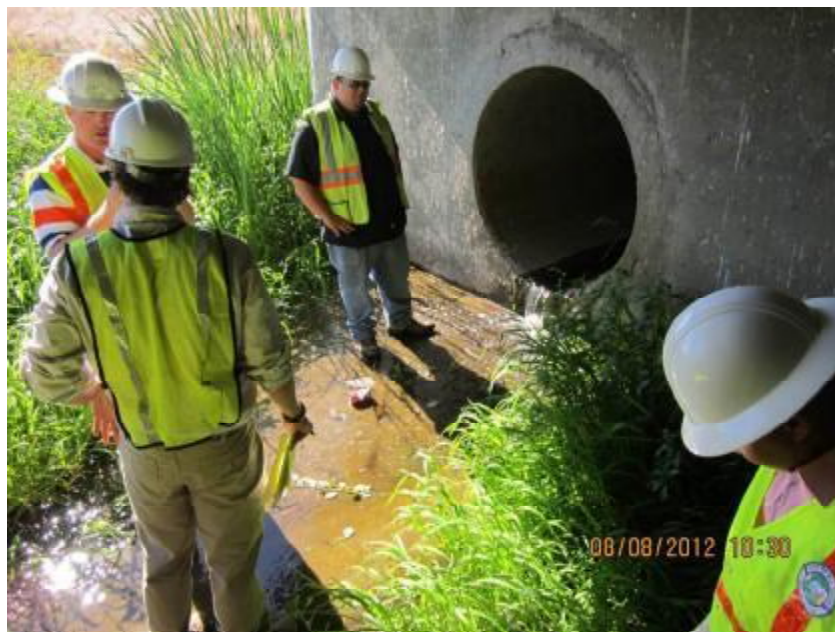
Photograph 3. View of outfall to Shed B Channel. Note dry weather flow from outfall.