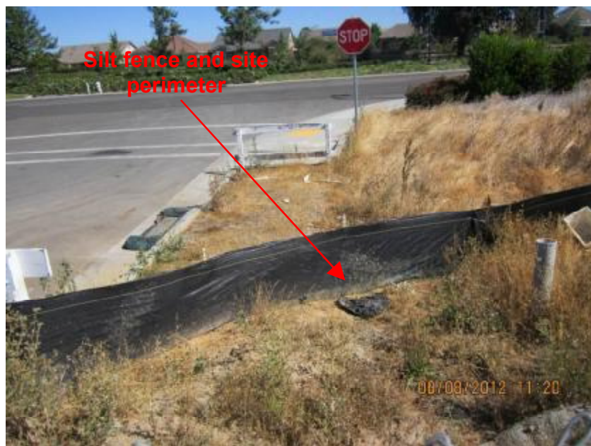
Photograph 7. View of silt fence BMP installed downgradient of the straw wattles shown in Photographs 5 and 6.