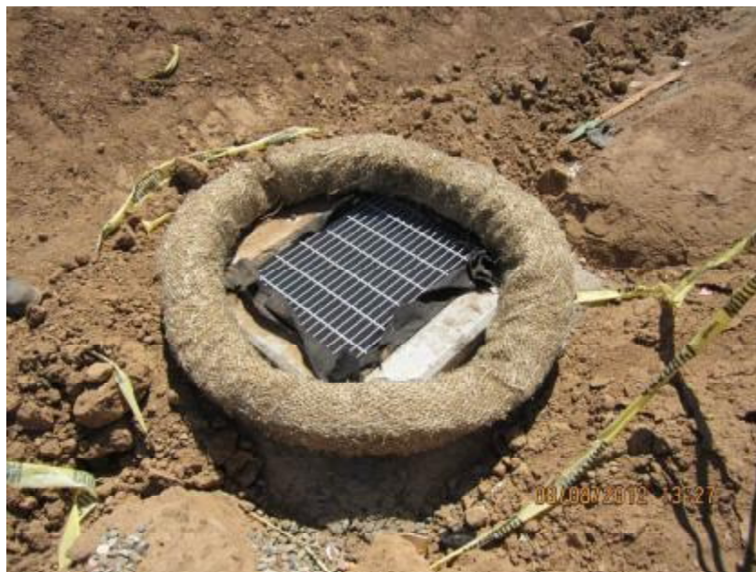
Photograph 9. Laguna Corporate Center Construction Project – Additional example of storm drain inlet in parking lot area surrounded by straw wattles which were not entrenched into the ground.