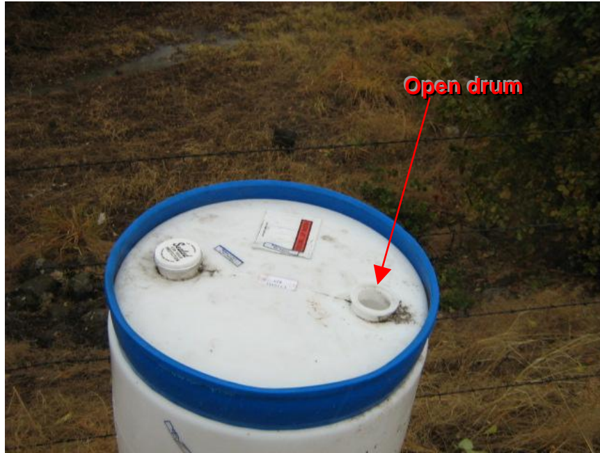
Photograph 3. District 2 Red Bluff Slab Project – Open drum of detergent along the highway storm water conveyance system. (Note: Drum appeared empty, possibly due to the missing bung)