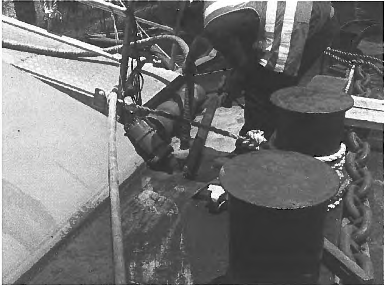
Sump and hose used to remove stormwater from deck of drydock.