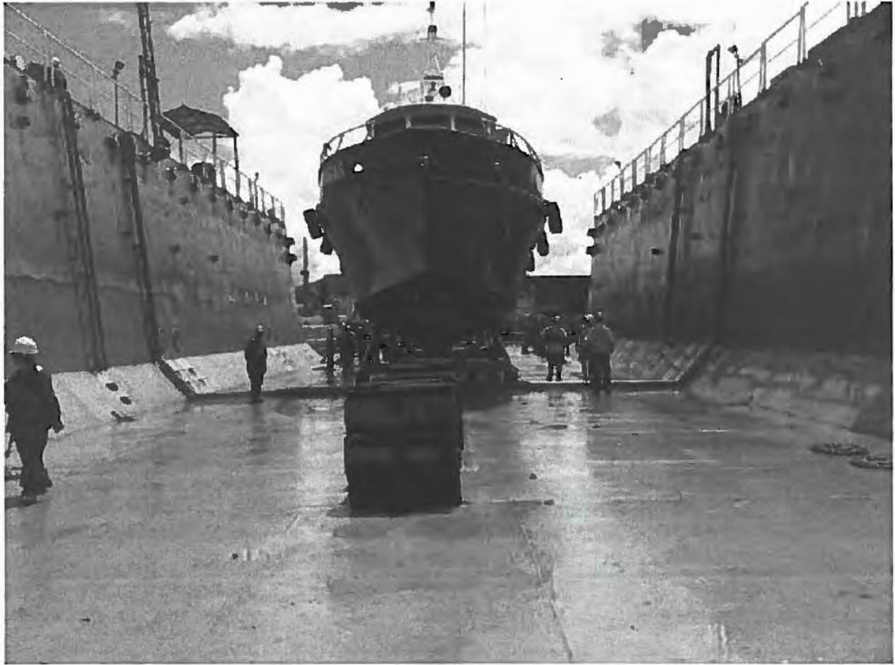
Close up of interior walls and flooring (May 2012)