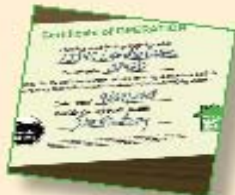
Your approval certificate can be a great selling point.

Over the years we've gotten smart about the impact of septic systems in Boulder County. There is clear evidence that aging, unapproved septic systems are leaking into our water system. This is bad news for our health and for the environment. New regulations, effective September 1, 2008, in Boulder County will protect our health and environment.