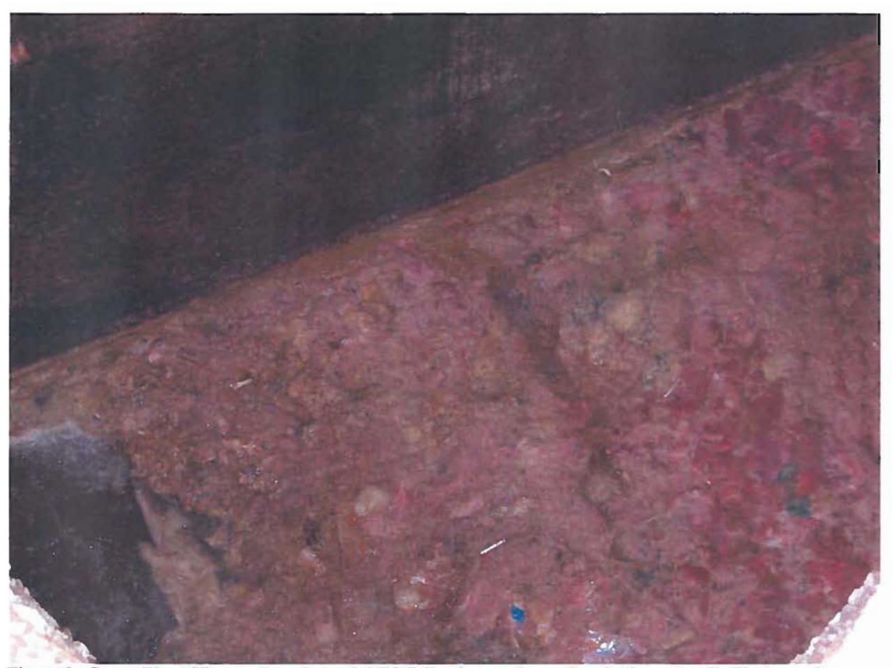
Figure 2: Sewer Plant #7, note the substantial FOG floating on the surface in the wet well.