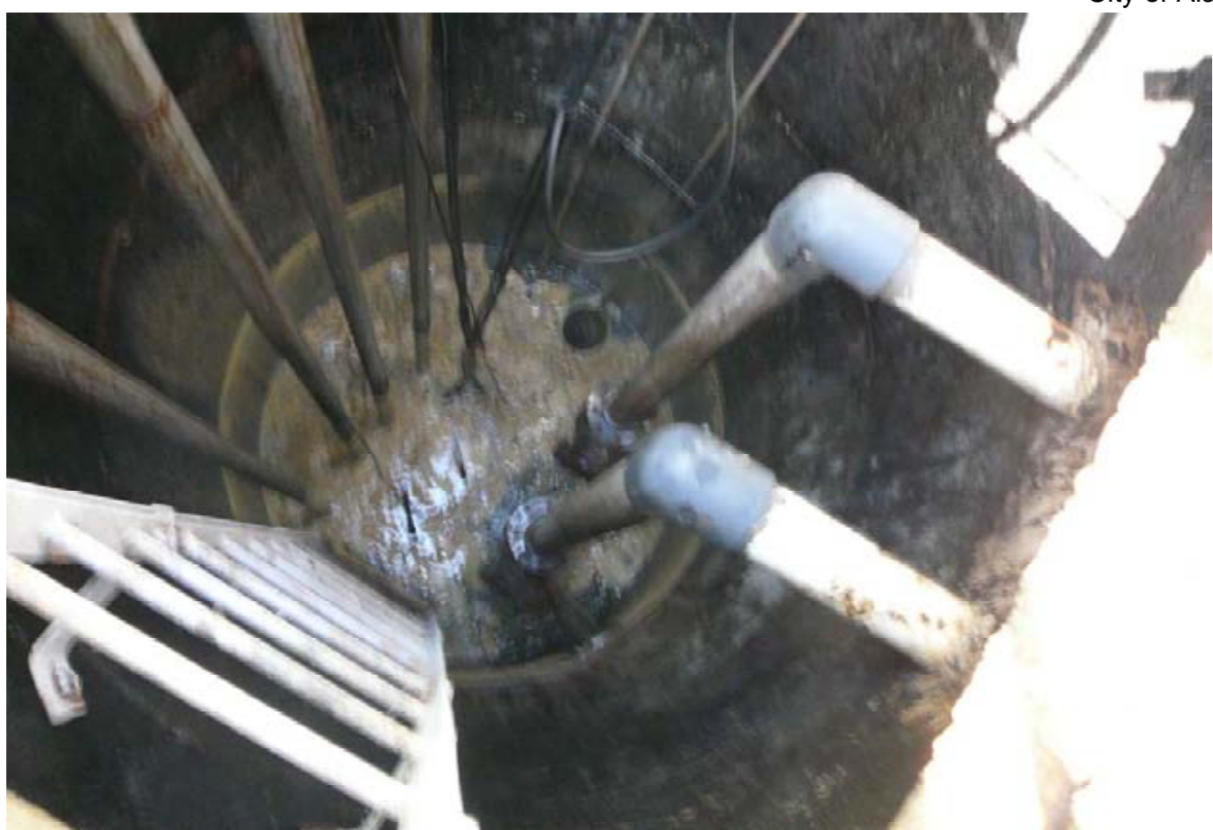
Alameda Photo 3 - Dublin pump station wet well