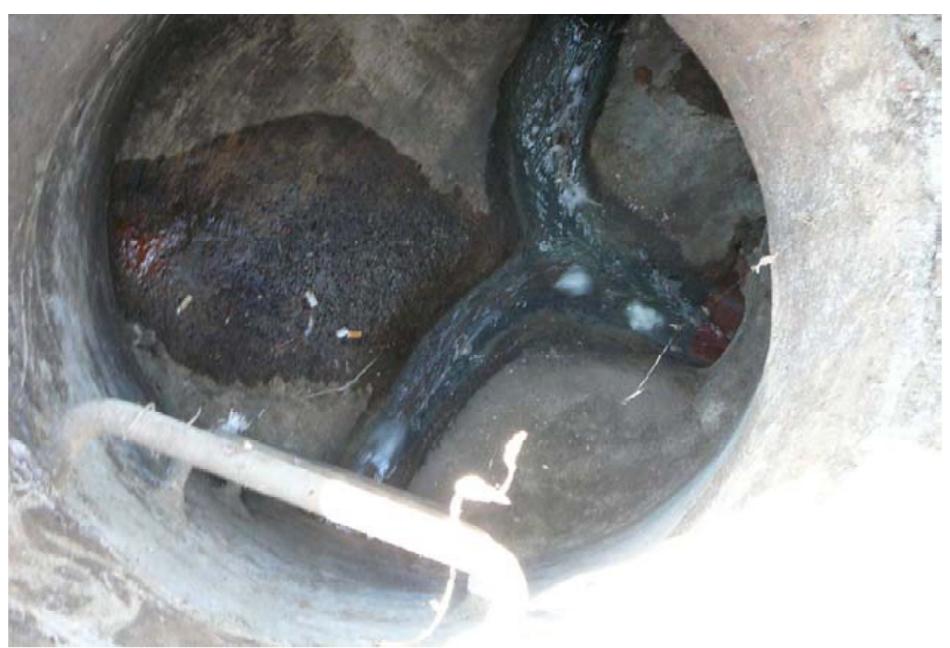
Alameda Photo 16 - Kitty Hawk spill site manhole