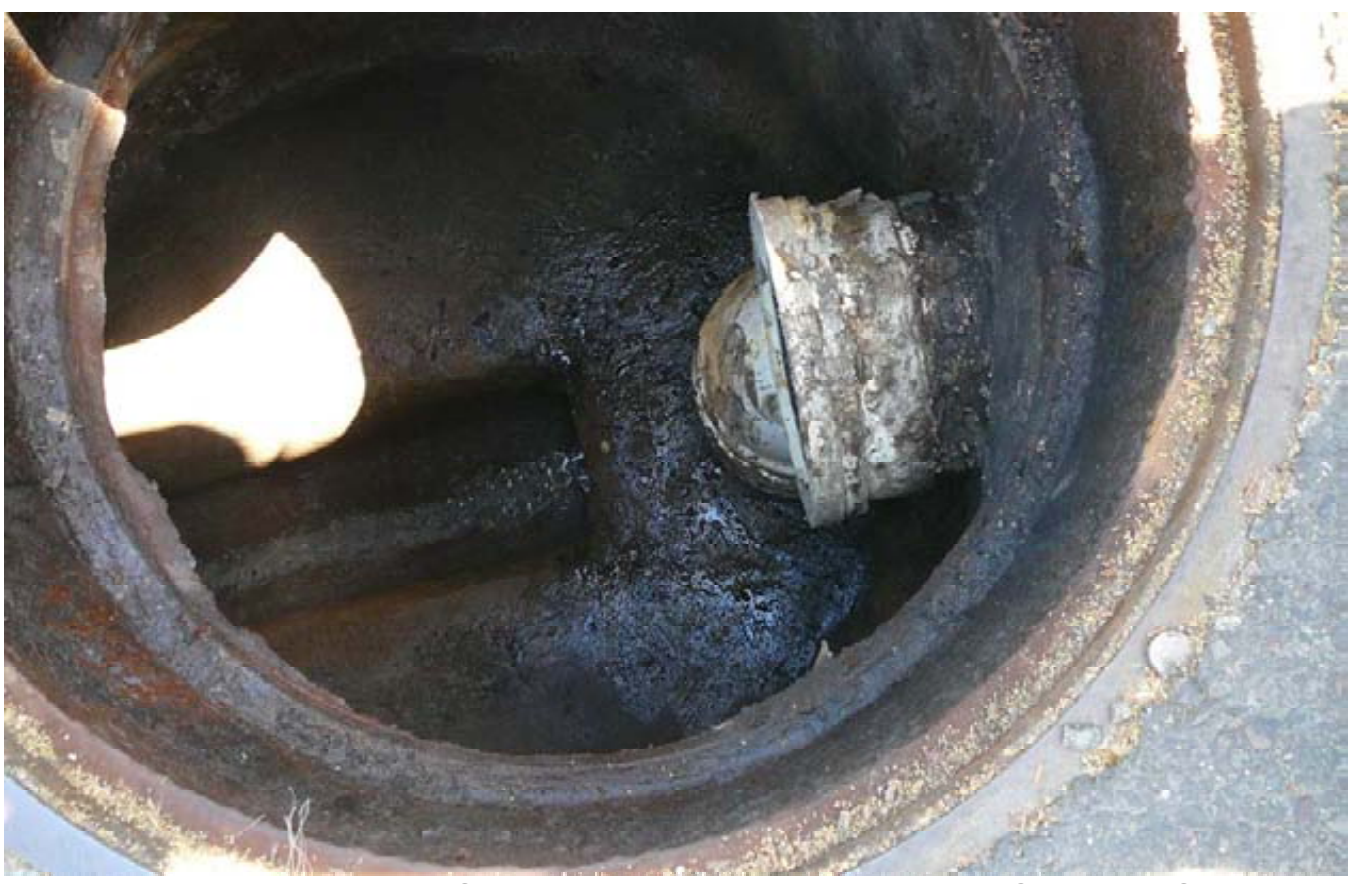
Alameda Photo 10 - Spill site at Alameda Federal Center - Second manhole showing pipe fix