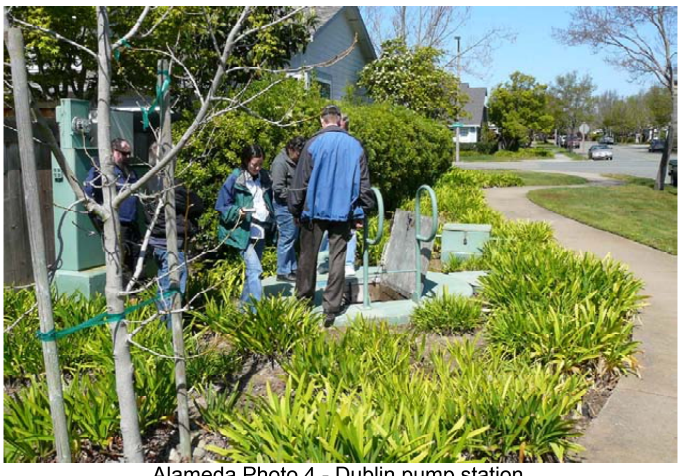
Alameda Photo 4 - Dublin pump station