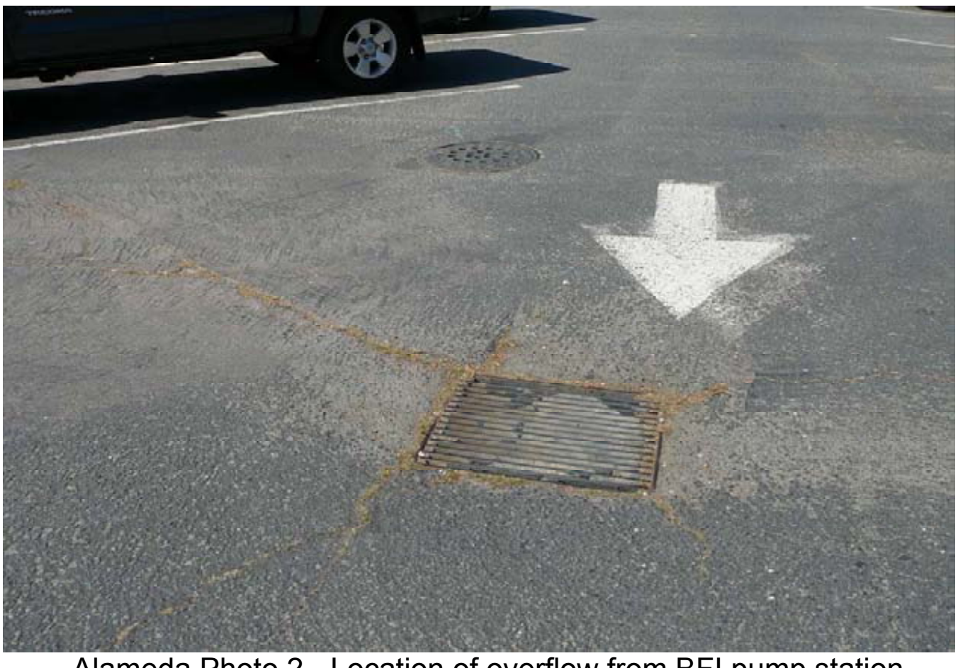
Alameda Photo 2 - Location of overflow from BFI pump station