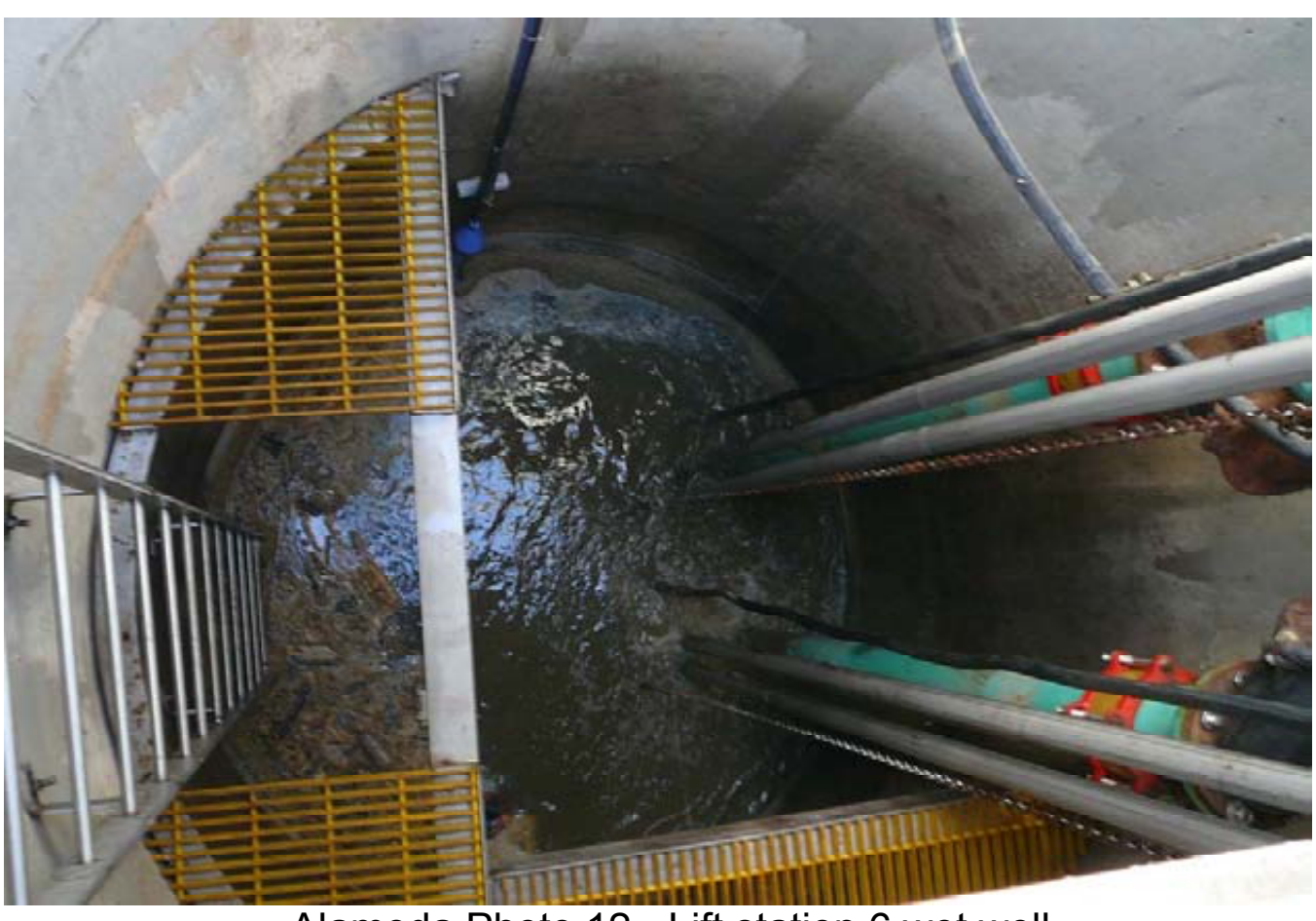
Alameda Photo 12 - Lift station 6 wet well