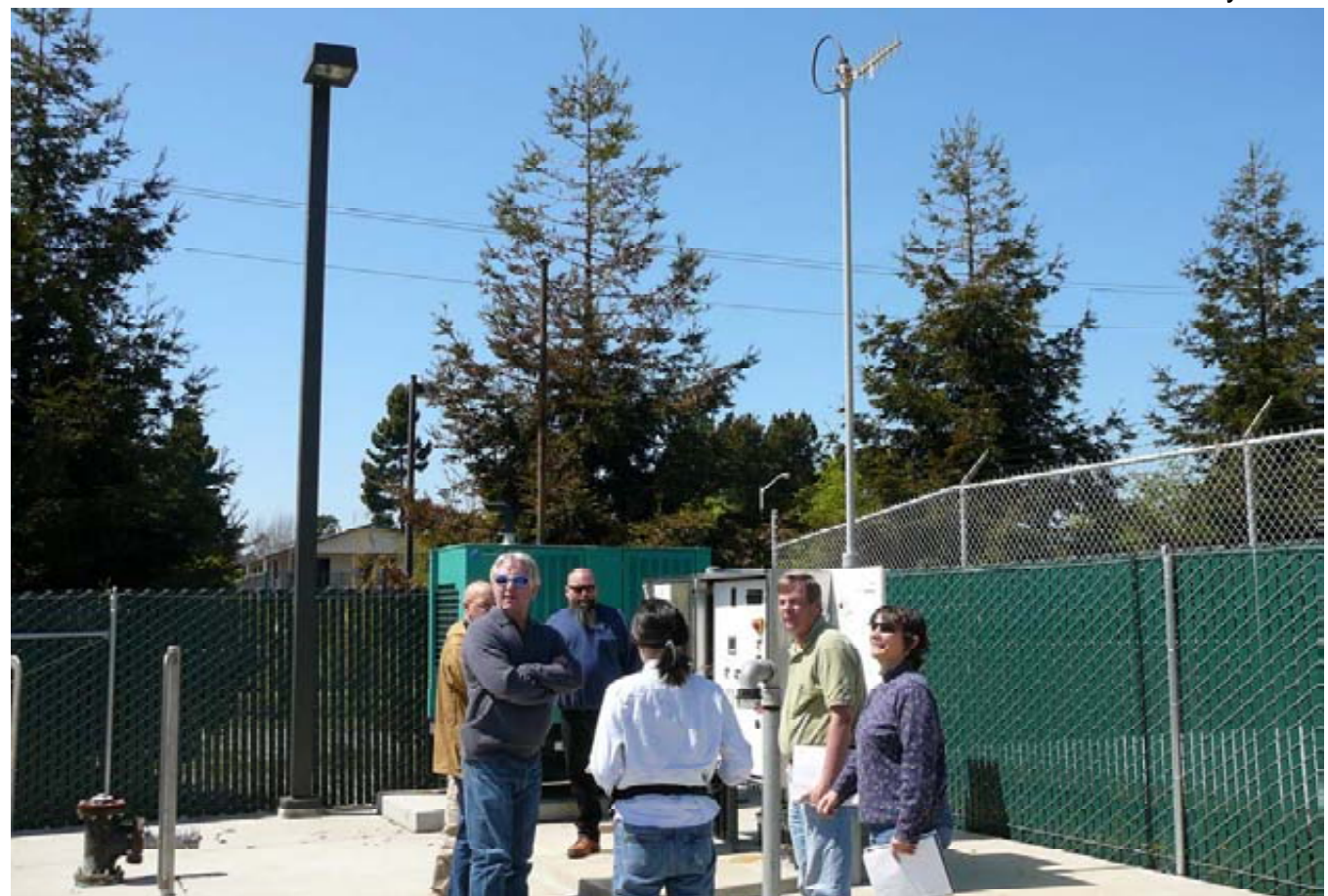
Alameda Photo 11 - Lift station 6