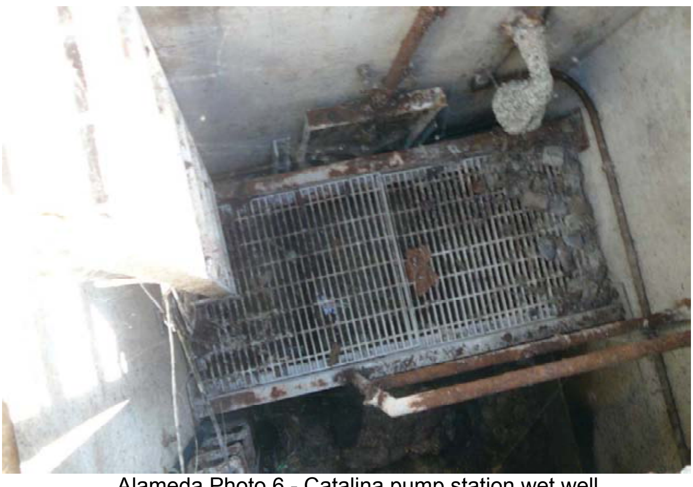
Alameda Photo 6 - Catalina pump station wet well