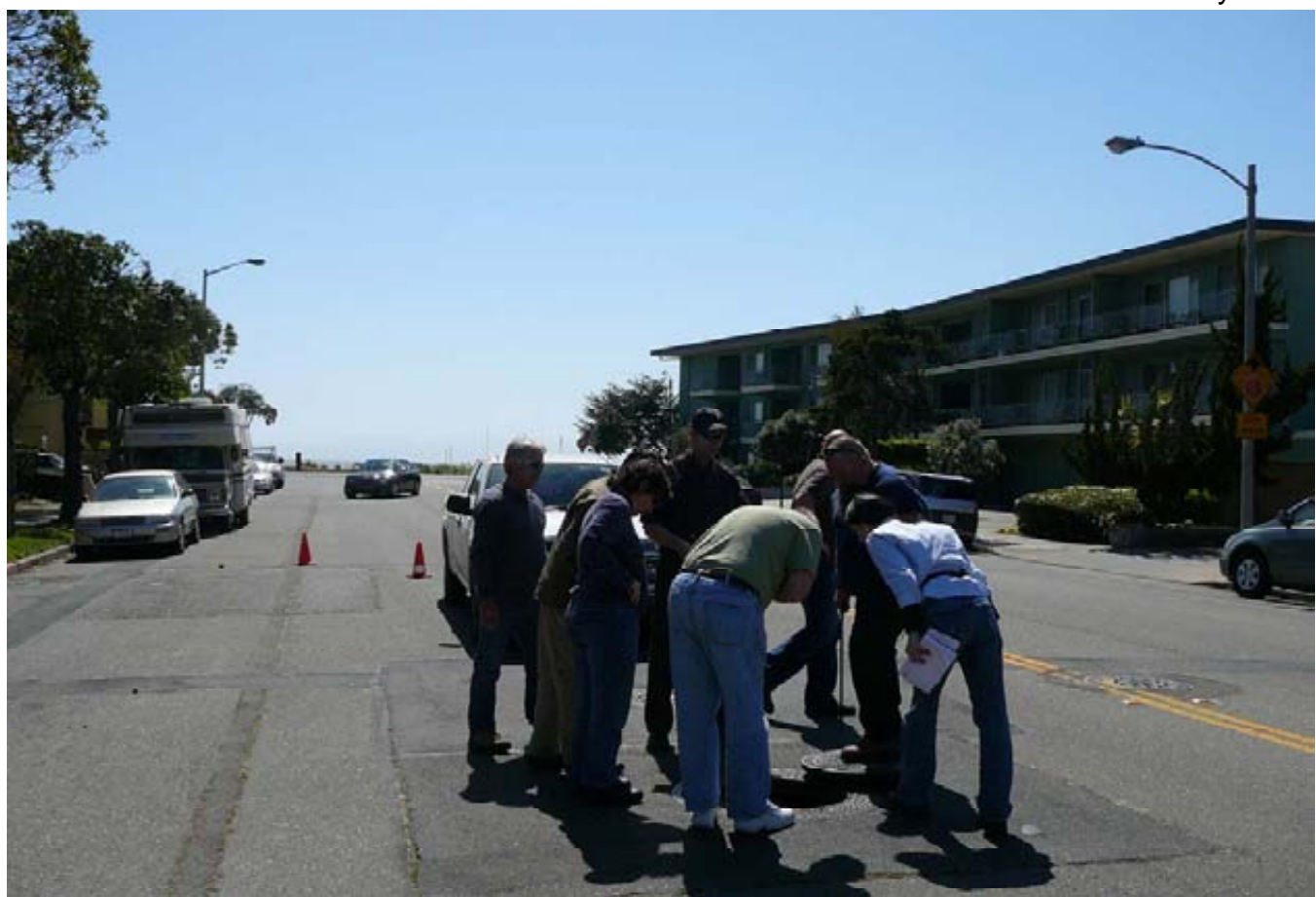
Alameda Photo 13 - Willow pump station