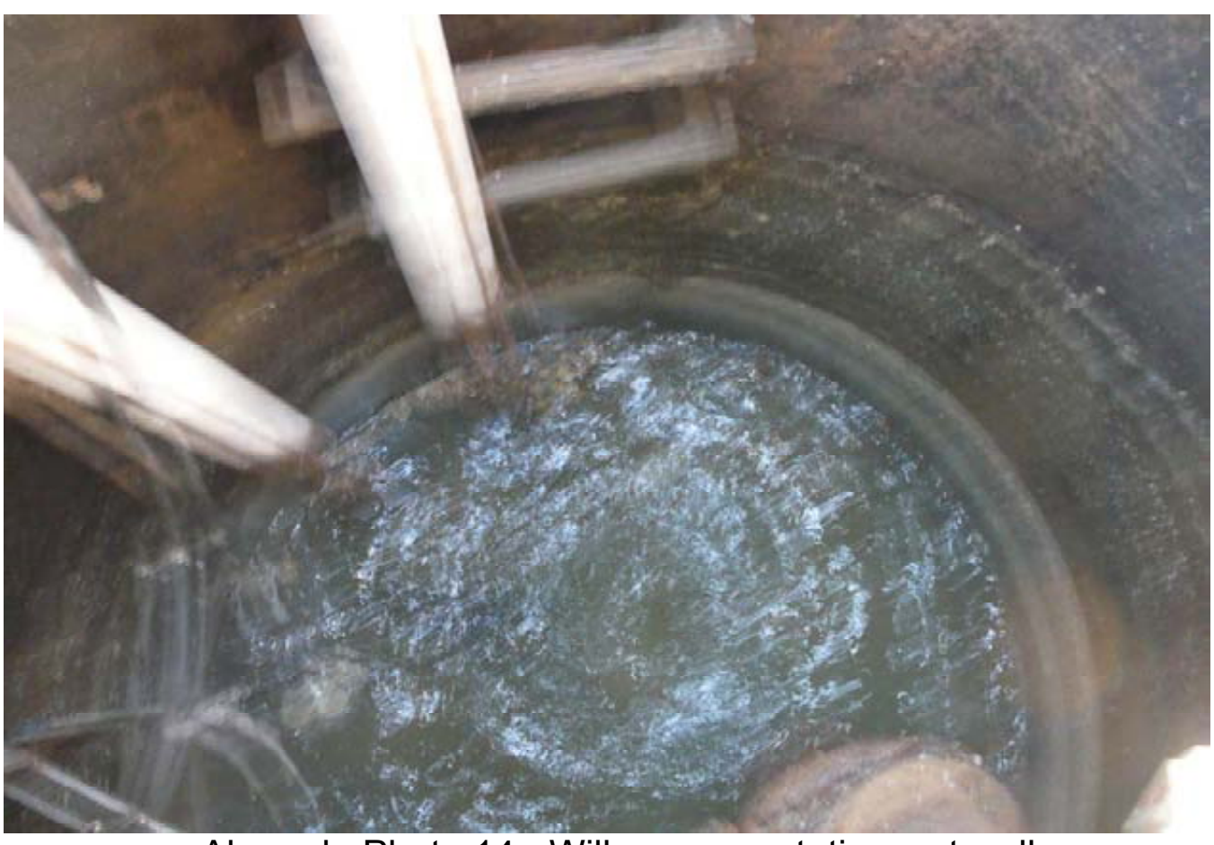
Alameda Photo 14 - Willow pump station wet well