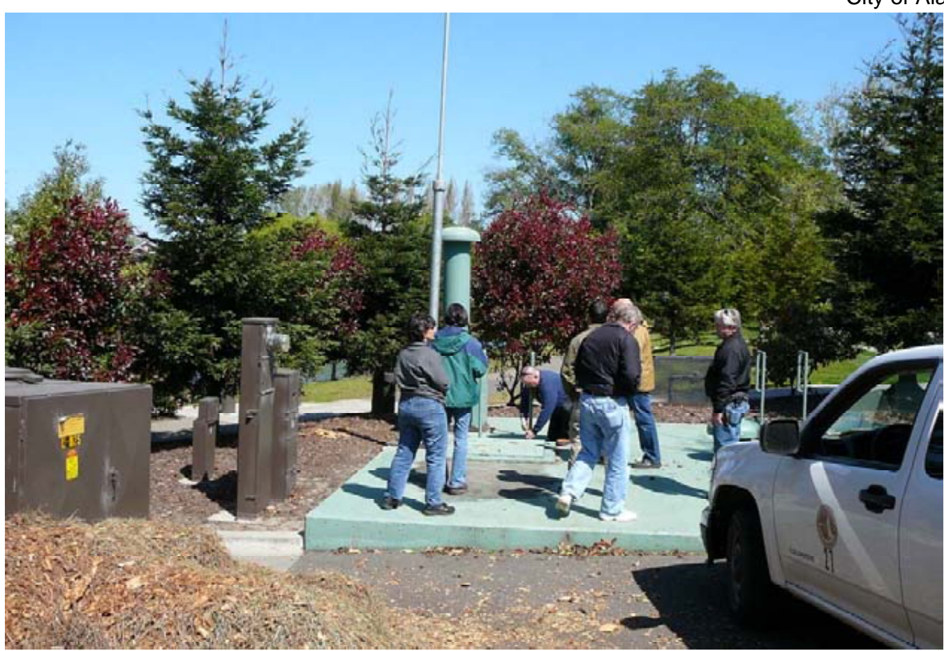
Alameda Photo 5 - Catalina pump station