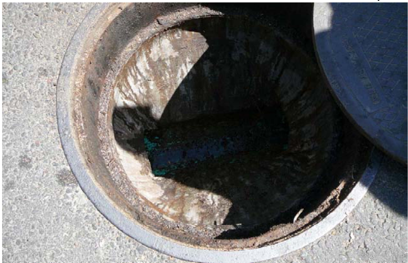
Alameda Photo 9 - Spill site at Alameda Federal Center - Manhole that overflowed