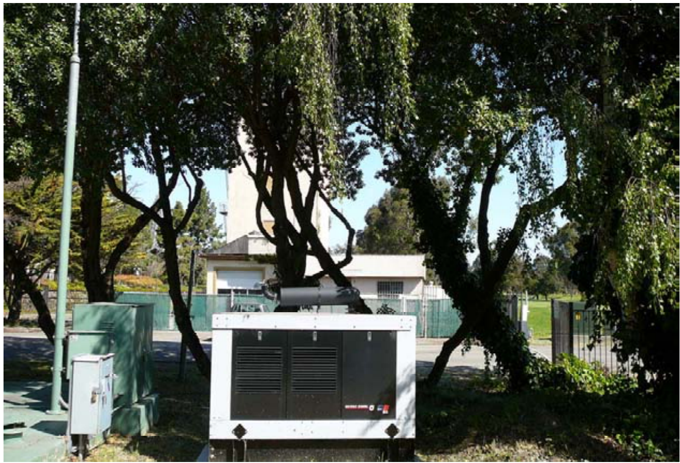
Alameda Photo 1 - BFI pump station