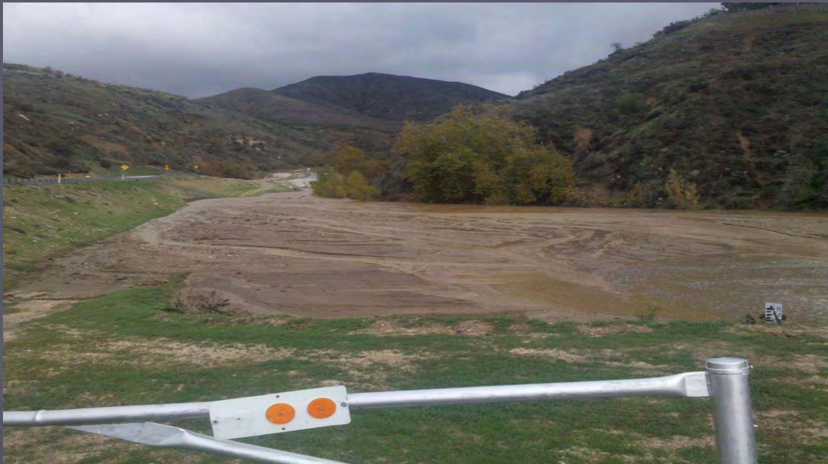
Sand Canyon Sedimentation basin – Flood Control District (15ft of material deposited)