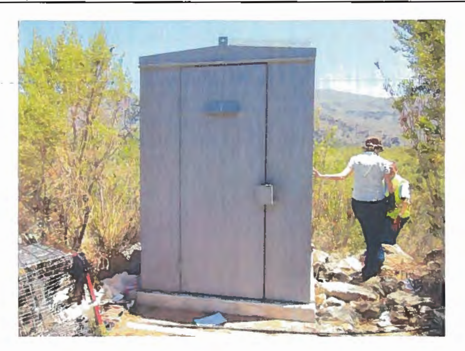
Photograph 3. City Monitoring Outfall – View of VCWPD monitoring box located north of the City Monitoring Outfall.