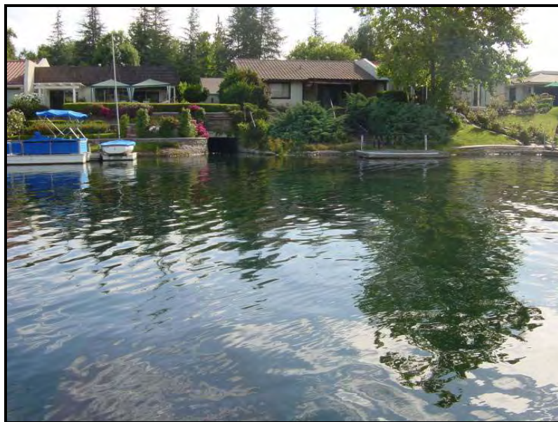
Figure 13-4. Sampling Location in Front of Storm Drain (WL3)

As of the writing of this TMDL, there are no non-MS4 NPDES permitted discharges in the Westlake Lake watershed. This includes non-stormwater discharges (individual and general permits) as well as general stormwater permits associated with construction and industrial activities.