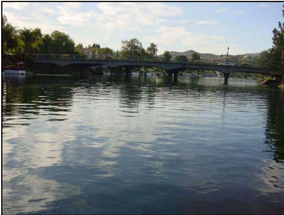
Figure 13-2. View of Westlake Lake