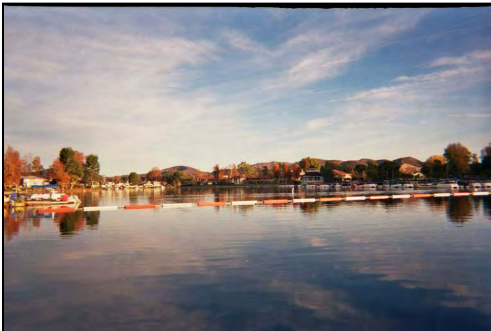
Figure 13-3. Sampling Location is at the Buoys (WL1)