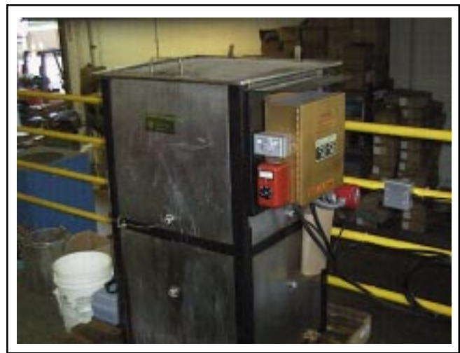
Ultrasonic Cleaning Unit

An oil skimmer and particulate filter are optional features that were not available for the ultrasonic unit demonstrated at the Artistic facility. Instead, Artistic staff used hydrophobic absorbent pads to remove oil that floated to the top of the